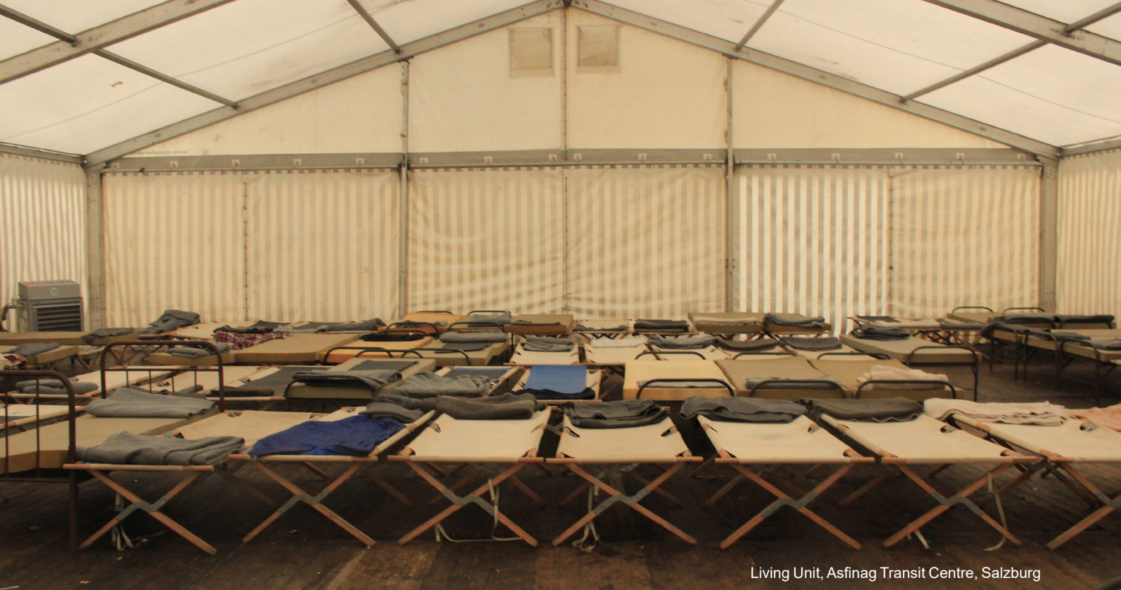
Living Unit, Asfinag Transit Centre, Salzburg