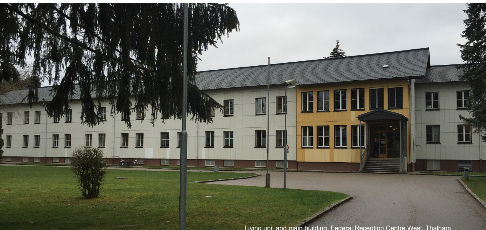
Living unit and main building, Federal Reception Centre West, Thalham

One initial reception centre (EAST) and one distribution centre (VQ) were visited as part of ECRE's study visit; a short description of each centre is set out below.