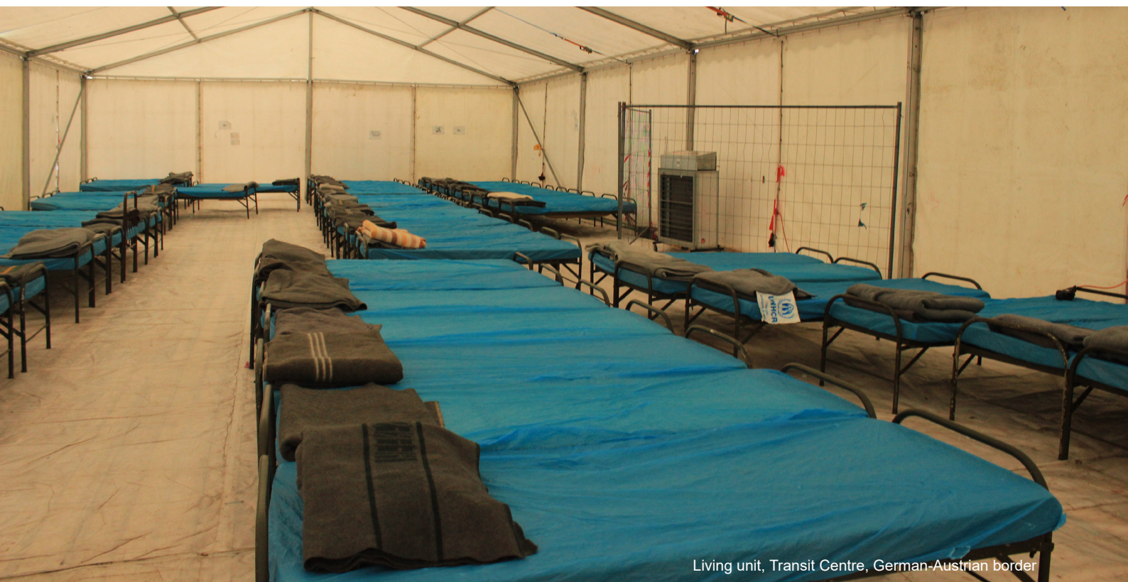
Living unit, Transit Centre, German-Austrian border

According to the Head of Operations at Asfinag Transit Centre, on the date of visit, 1 December 2015, there were approximately 200 asylum seekers staying in the centre. They are housed in two separate buildings in the complex which are federally managed. According to ORF, as of 20 November, almost half of the places in Asfinag were being used to house asylum seekers. 150 Asylum seekers stay in the centre until a more appropriate reception place becomes available; however given the lack of suitable places, asylum seekers can end up staying in transit centres for the duration of the asylum procedure in wholly unsuitable conditions. Their accommodation is an old warehouse where there are rows and rows of bunkbeds.