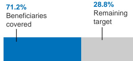
Refugees who received core relief items