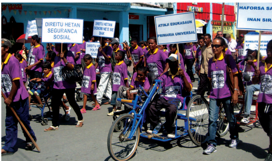
Persons with disabilities advocate for their rights in a solidarity march on the International Day of Persons with Disabilities in 2010 in Dili.