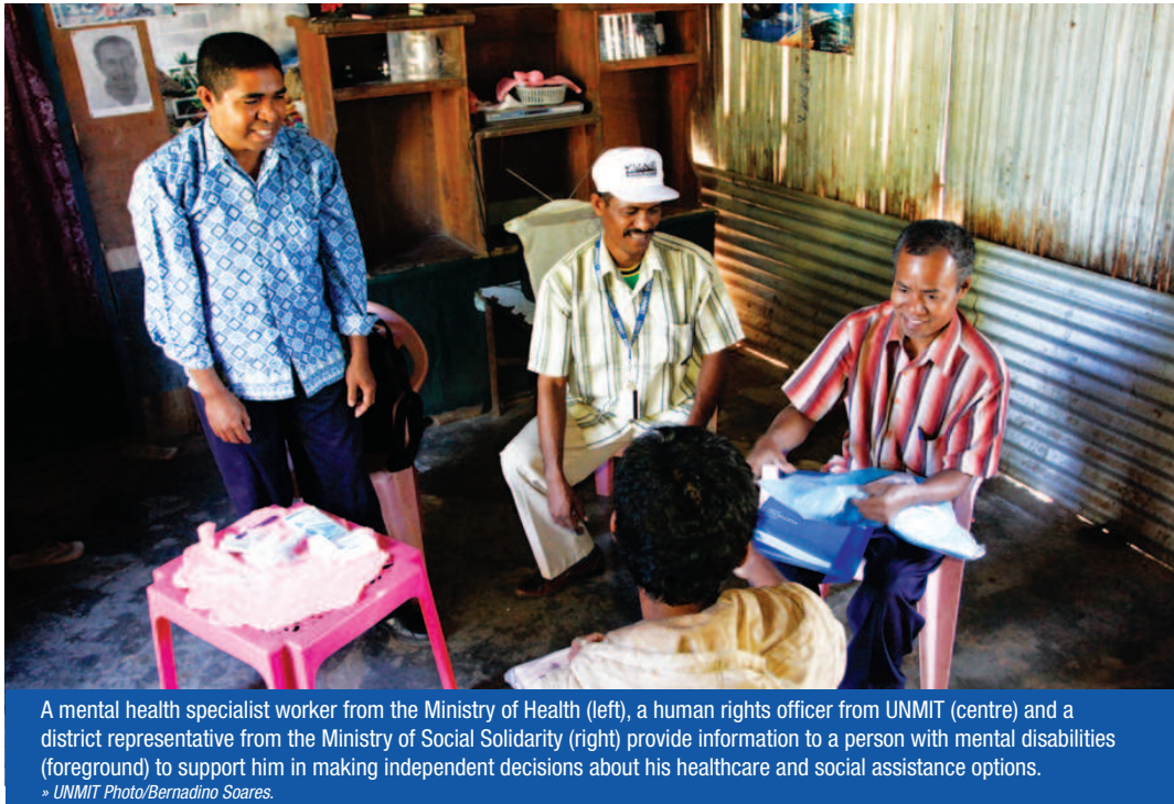
A mental health specialist worker from the Ministry of Health (left), a human rights officer from UNMIT (centre) and a district representative from the Ministry of Social Solidarity (right) provide information to a person with mental disabilities (foreground) to support him in making independent decisions about his healthcare and social assistance options.

During 2010, HRTJS in collaboration with MSS and specialist Mental Health Workers, succeeded in the release of two of these persons held in permanent restraints. HRTJS continues to monitor to ensure these persons with mental disabilities are receiving adequate healthcare services and remain free. HRTJS also continues to engage with relevant state actors and families to negotiate other releases.