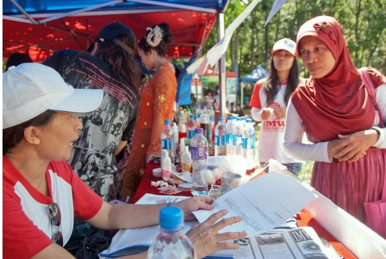
Figure 7: IMWU activists at an information stall in Hong Kong's Victoria Park