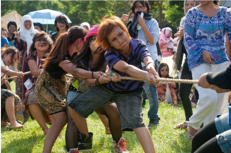
Figure 5: Indonesian domestic workers enjoying a game of tug-of-war in Hong Kong's Victoria Park

“Upon arrival in Hong Kong, the head of the placement agency told me that I couldn't leave the employing household for seven months. He said I had to obey or face termination. But even after seven months, I was only given a rest day twice per month. Also, I couldn't leave the house until 10am because I had to prepare breakfast for my employing family first and I had to return by 9pm.” 276