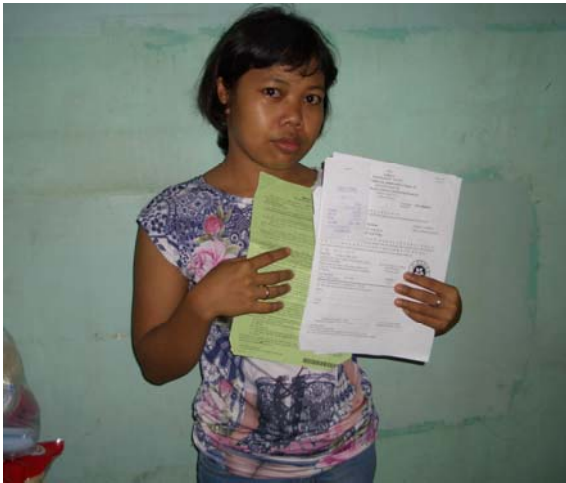
Figure 10: Upon completion of her case, an Indonesian domestic worker holds up her contract and Labour Tribunal documents

The cumulative effect of the policies and practices described above and in previous sections is to seriously impede Indonesian migrant domestic workers from pursuing compensation and accessing justice in Hong Kong. This is reflected in the fact that 43 per cent of respondents to the IMWU survey stated that they did not file a complaint even when they had a problem. 413