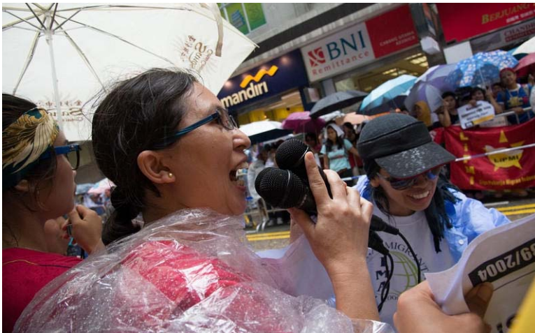
Figure 9: Migrant domestic workers protesting in front of the Indonesian Consulate

"When I went to the placement agency to complain about the deductions, they said that this was a pre-arranged agreement set by the recruitment agency in Indonesia. I complained three times but they didn't help me at all. After each attempt, I followed up by going next door to the Indonesian Consulate. But on all three occasions, the staff refused responsibility by saying that this was an agreement between the Hong Kong and Indonesian agencies so they could not intervene to help me." 392