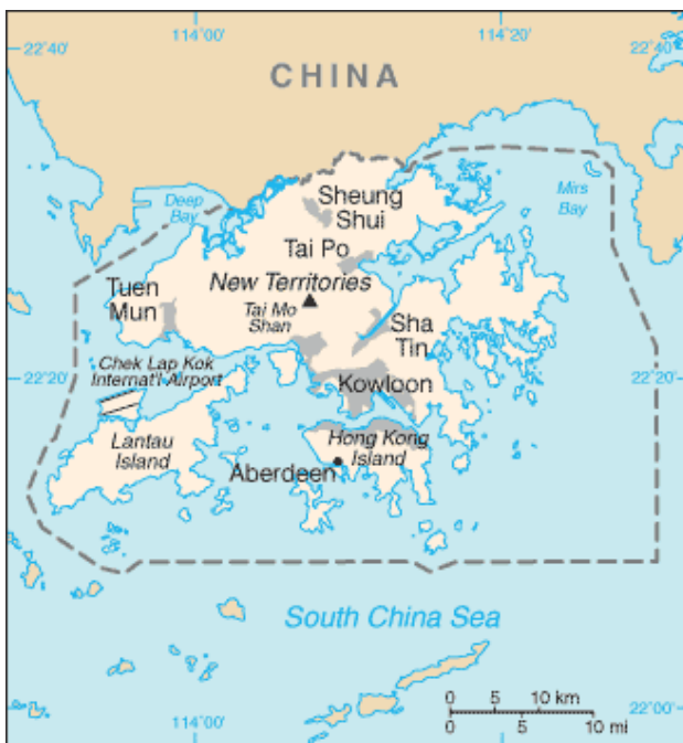
Figure 13: Map of Hong Kong SAR