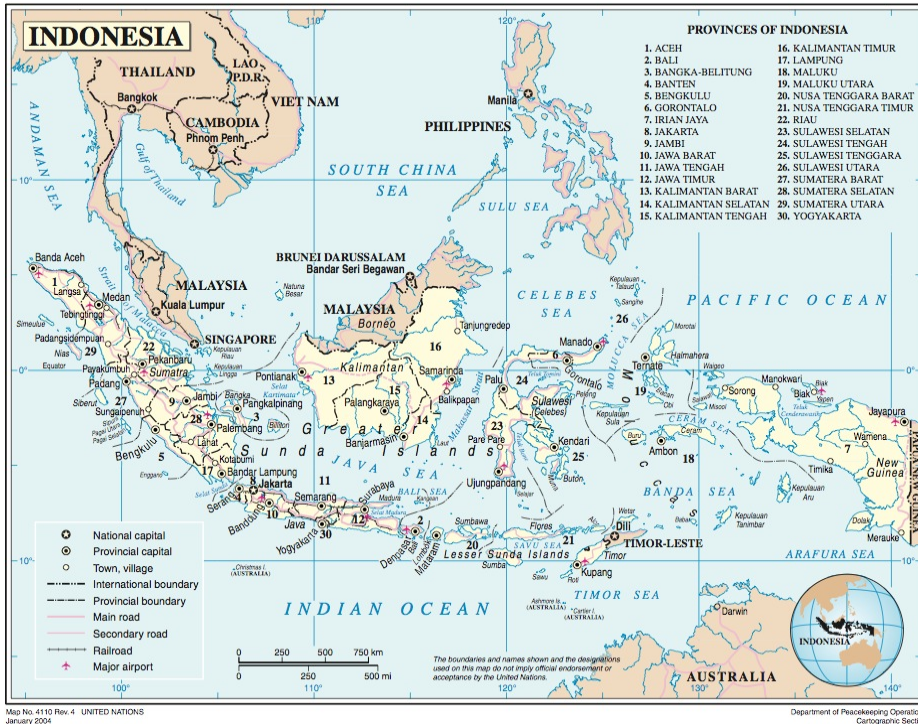
Figure 12: Map of Indonesia