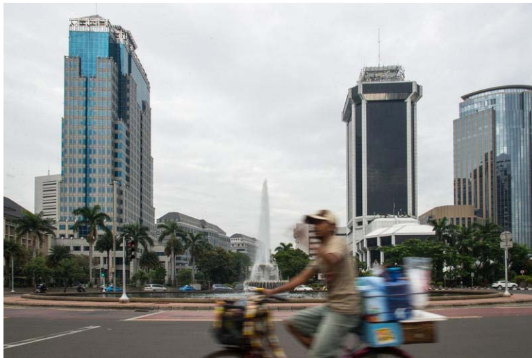
Figure 4: Many women go to Jakarta for training before working as domestic workers in Hong Kong

In view of the above, it is not surprising that many interviewees were made to pay for some items or services (e.g. books, uniforms, medical exam and competency test), which are already included in the official recruitment fee – effectively being double charged. Eleven women Amnesty International spoke with reported that they also had to purchase some of these items at the training centre, where the price was more expensive than elsewhere. Most remarked that they had “no choice” but to buy them at the training centre, as they were not permitted to leave because they are unable to provide collateral (see section 4.3). The IMWU survey found that 69 per cent of those interviewed were required to purchase books, stationery, uniforms and other items directly from the recruitment agency at inflated prices 107 and 14 per cent had to pay an additional fee to sit their competency exam. 108