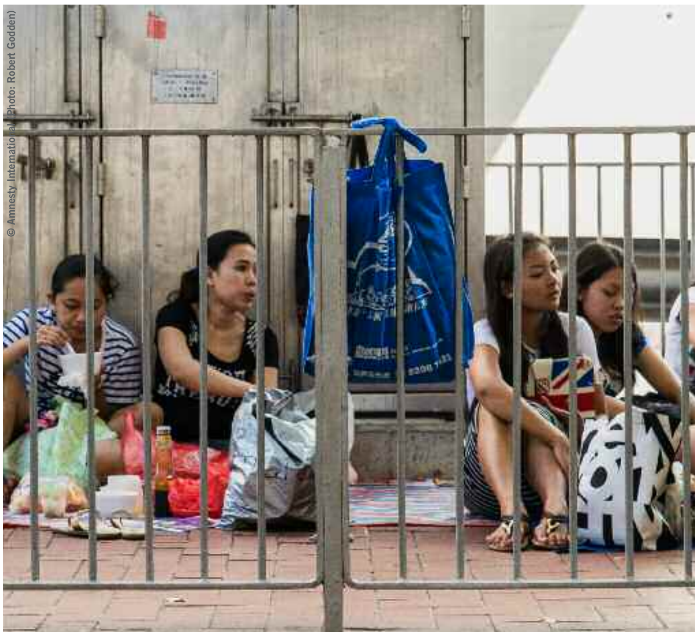
Indonesian migrant domestic workers during their statutory rest day in Victoria Park, Causeway Bay, Hong Kong, June 2013.

Almost 4 million Indonesians have officially migrated abroad for work since 2006. The majority of them are women who take on domestic work in private homes. Poverty and unemployment compel them to seek opportunities abroad, including Hong Kong. Yet for many Indonesian migrant domestic workers, hopes for a better life are crushed by a migration process that is fraught with duplicity and abuse from the moment they enter it.