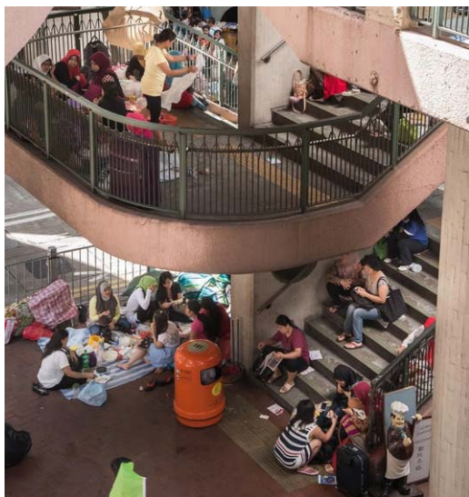
Figure 6: On Sundays, many Indonesian domestic workers gather at Causeway Bay, Hong Kong

The mandatory live-in requirement increases workers’ isolation and the consequent risk of being subject to exploitation and abuse. An option to live outside of the house would provide migrant domestic workers with a way out of situations where their basic rights are being violated (e.g. where their privacy is not being respected and/or they are at risk of abuse from someone in the employer’s household or where they are being made to work excessive hours). It is also likely that migrant domestic workers would gain leverage in negotiations for better conditions of work if they had the option of leaving the employer’s house.