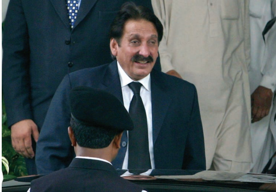
Deposed Chief Justice of Pakistan Iftikhar Mohammed Chaudhry.