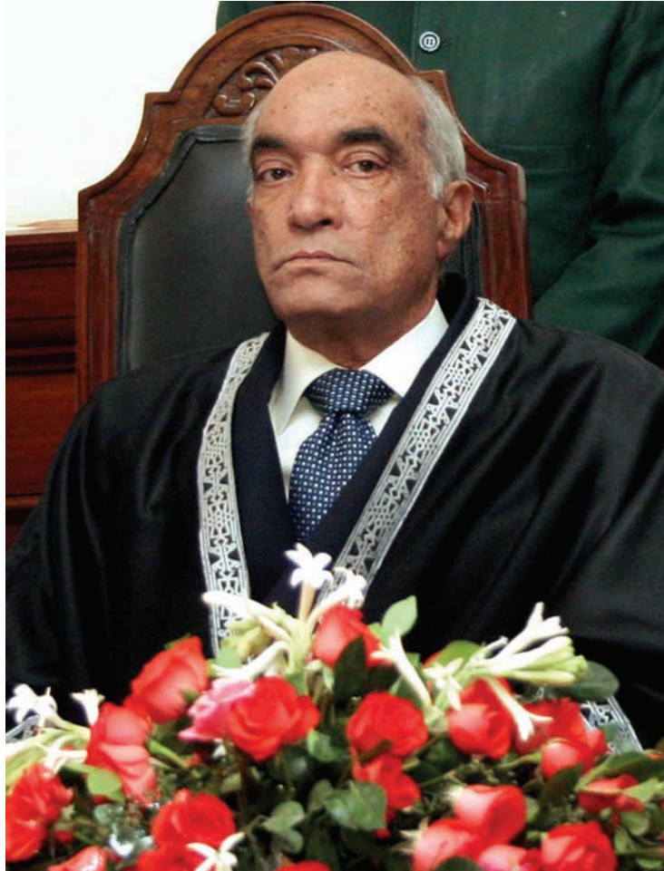
Khalilur Rehman Ramday, deposed Supreme Court judge.