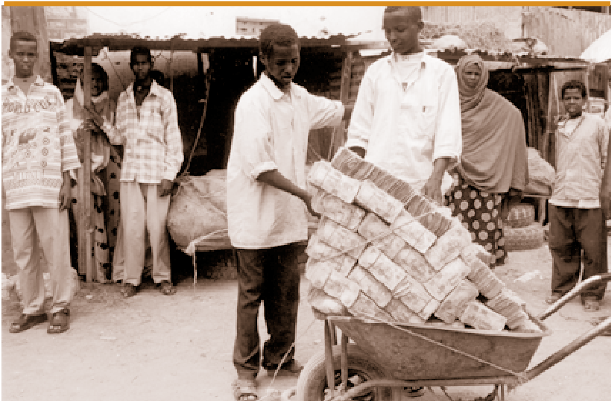
Young Somali men deliver Somaliland shillings to a hawala (money transfer center) in Burao. Somaliland has no central banking system. Nearly all of the millions of dollars transferred annually to Somaliland citizens from the Somali diaspora flow through the unregulated hawala system, which is based on trust and is widely utilized in many Muslim countries.

Many refugees repatriate to Somaliland hoping to find jobs in the livestock industry, primarily as livestock traders and milk wholesalers, but few find such work. A ban on Somali livestock by Saudi Arabia has left the economy reeling, and most returnees lack alternative job skills and have little education, leading to a grim economic future unless they find opportunities for skills training.