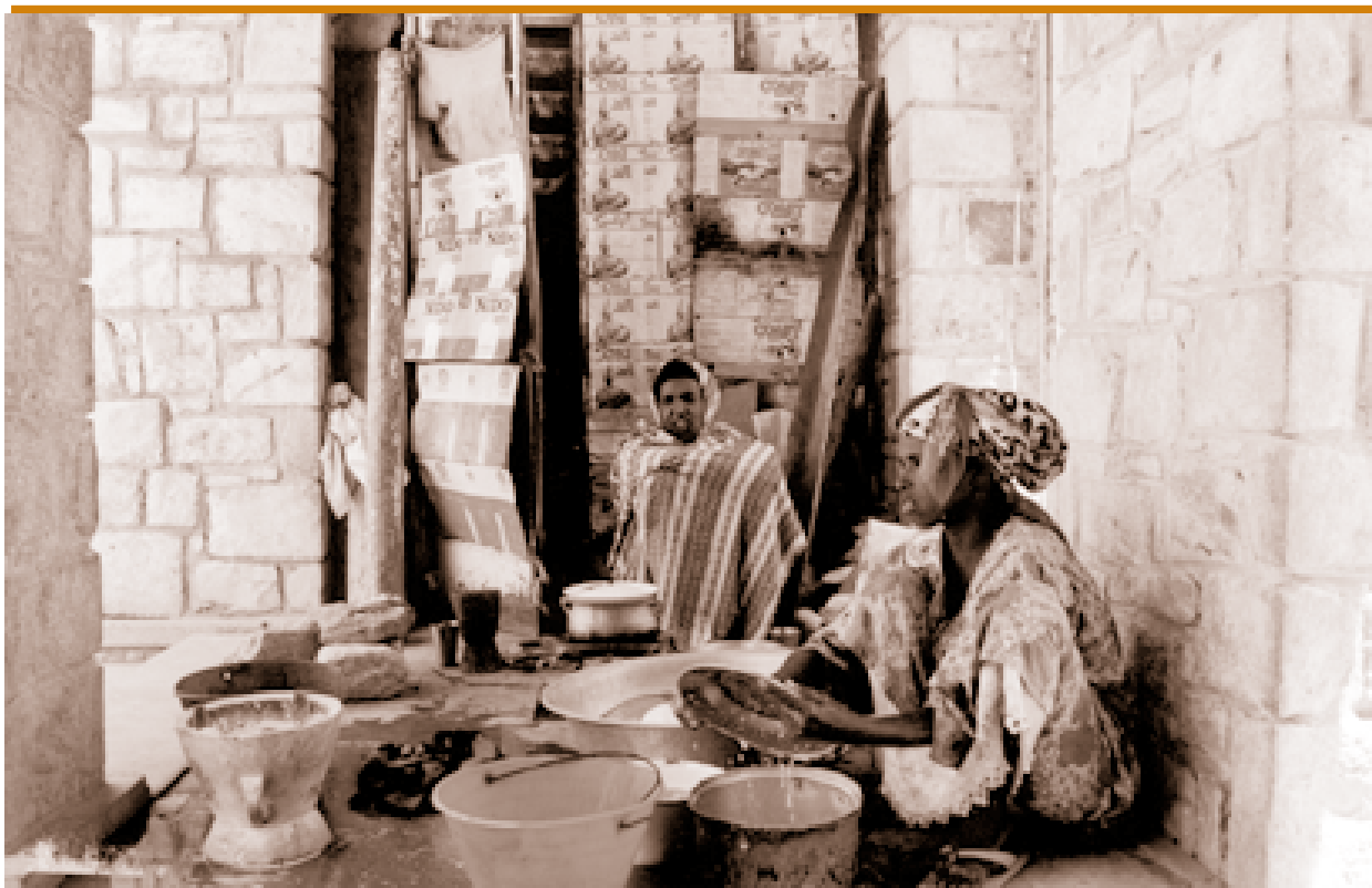
A Somali woman and her daughter tend to family chores in the entryway of their makeshift home, a single room in the former residence of the governor to British Somaliland. Abandoned decades ago, the residence and surrounding grounds are now home to thousands of former refugees who have repatriated to Hargeisa.

Since 1993, UNHCR has invested approximately $15 million in small-scale development projects to assist