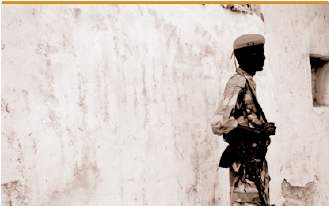
A Somaliland soldier stands guard at military base in Burao. Unlike central and southern Somalia, Somaliland enjoys relative peace ensured by a citizenry fatigued by war, a small police force, and a 10,000-man military.

escalated into a full-scale civil war—Somaliland’s second internal war in a span of four years. The conflict began in the capital, Hargeisa, and by March 1995 spread west to Burao and to Somaliland’s central regions of Woqooyi Galbeed and Togdheer.