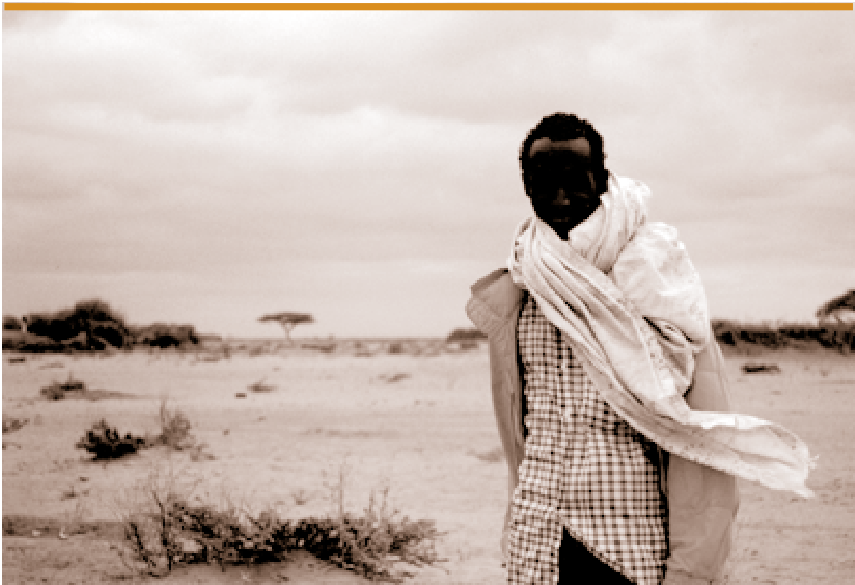
A Somali refugee walks in eastern Ethiopia's Ogaden desert, home to an estimated 80,000 Somali refugees, many of whom have lived in exile for more than a decade.