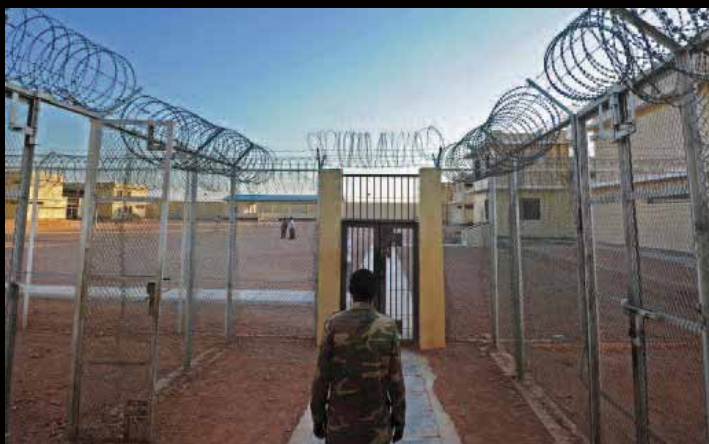
A prison warden at a prison in Garowe, Puntland state, in northeastern Somalia, December 2016. Fifty-four boys, some as young as 12, sent to fight by Al-Shabab in Puntland, spent months in this facility far from their homes. A military court sentenced 28 of the 54 boys to long prison terms, which they are now serving in a rehabilitation center in Garowe.

Human Rights Watch calls on the Somali government to end arbitrary detention of children and allow for systematic independent oversight of children in custody. Children taken into custody should be promptly transferred to child protection actors for rehabilitation and – when feasible – reintegration. Children accused of serious crimes should be tried by civilian courts in line with juvenile justice standards.