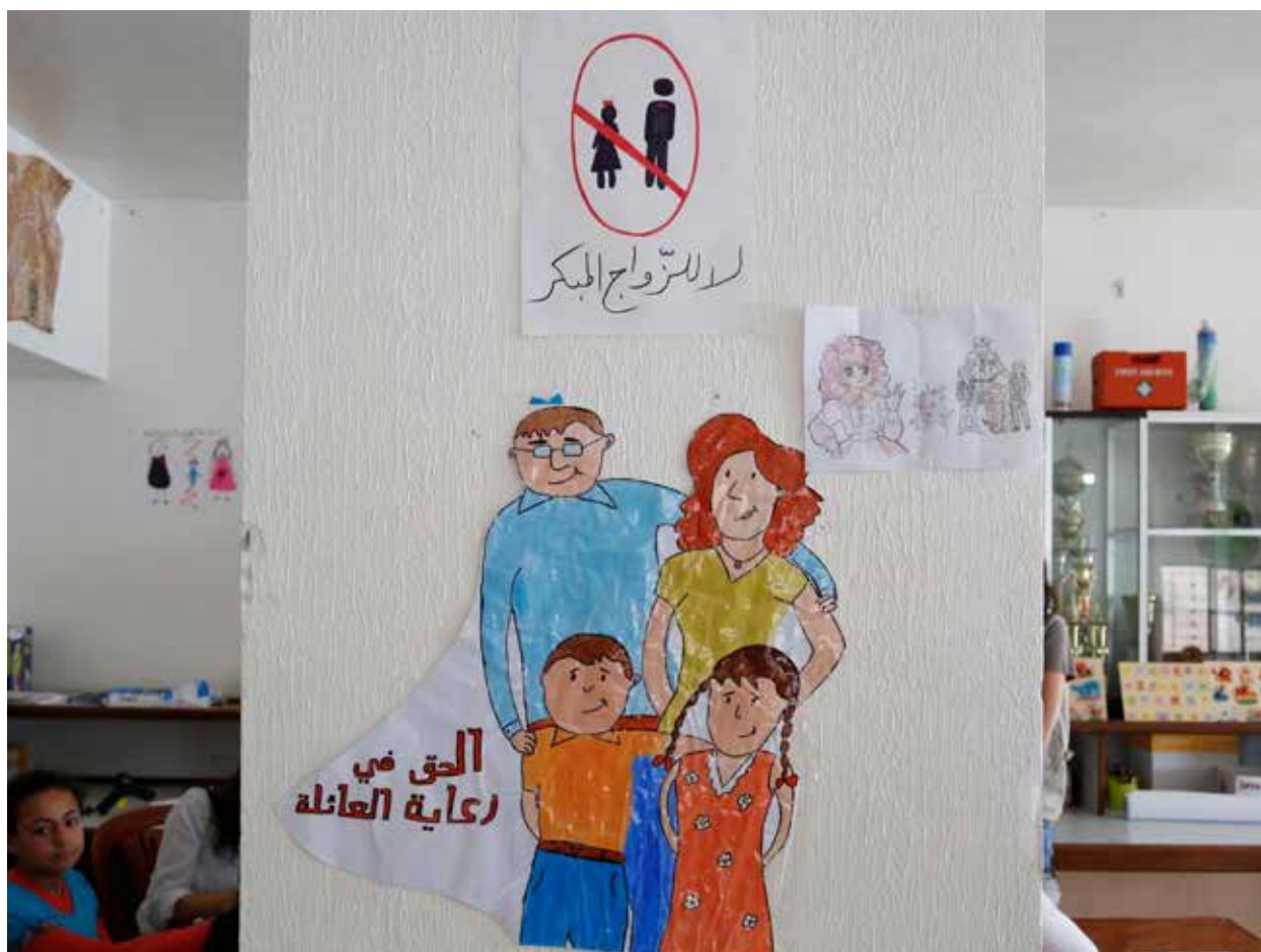
Drawings by young Syrian refugee girls in a community center in southern Lebanon promote the prevention of child marriage.