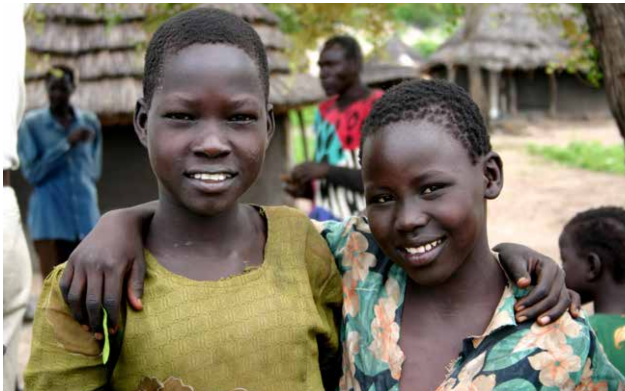
Displaced Ugandan girls.