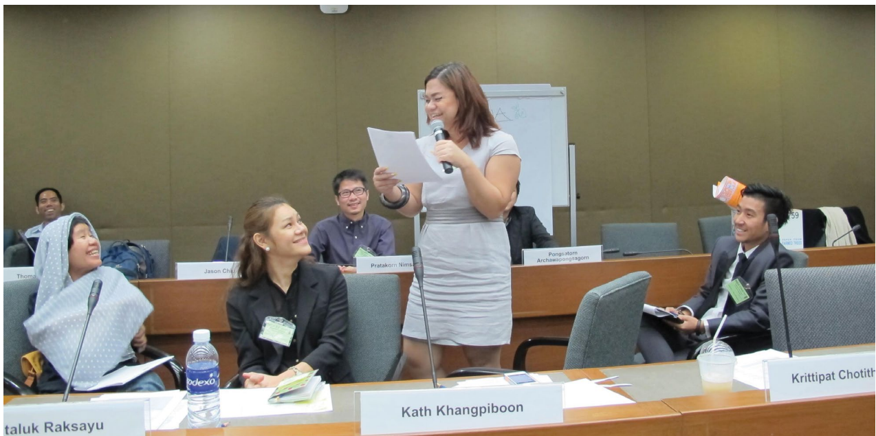
Findings and recommendations of the dialogue being presented by participants

The following section provides an overview of the protection of the rights of LGBT people in six areas: employment and housing; education and young people; health and well-being; family affairs and social and cultural attitudes; media and information and communication technology; and the organizational capacity of LGBT organizations.