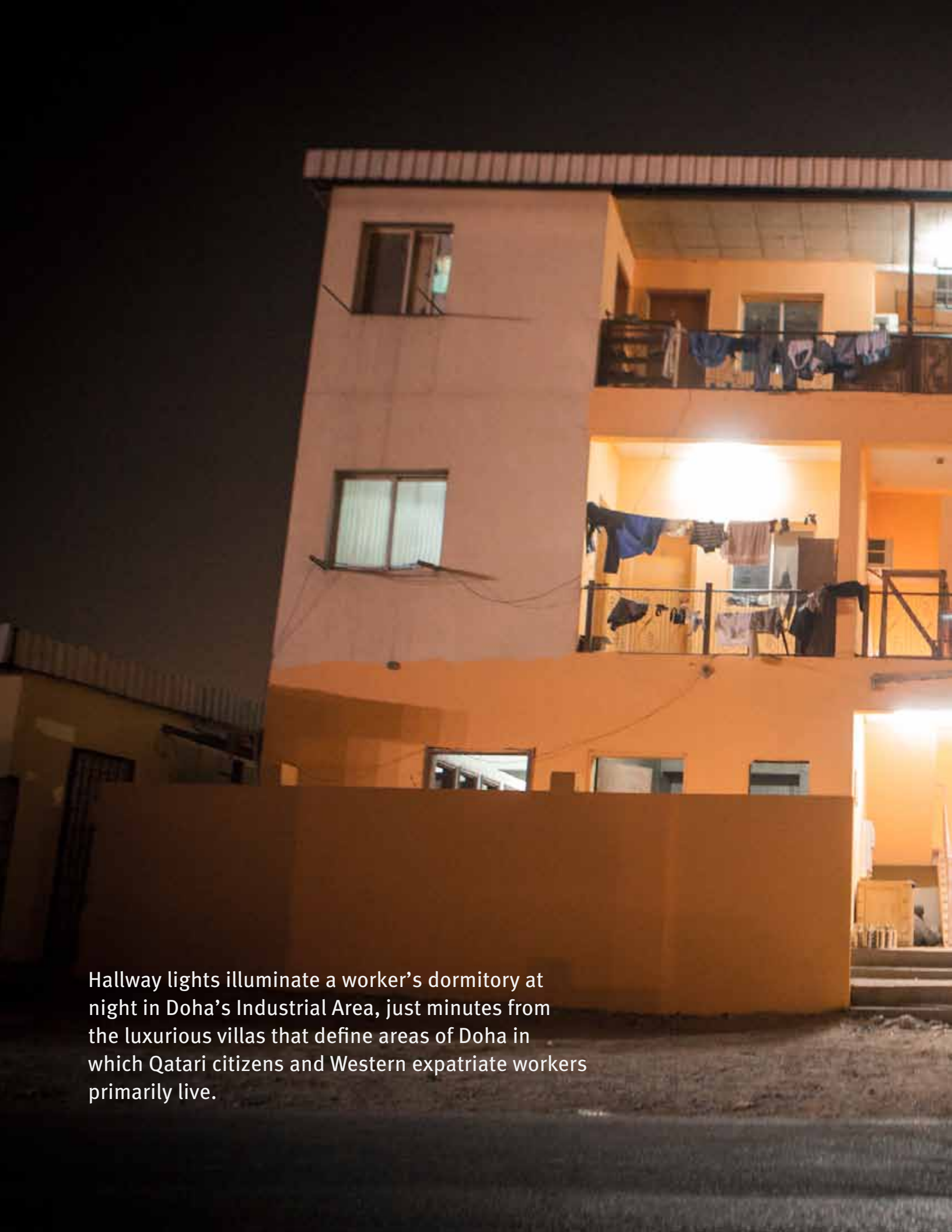
Hallway lights illuminate a worker's dormitory at night in Doha's Industrial Area, just minutes from the luxurious villas that define areas of Doha in which Qatari citizens and Western expatriate workers primarily live.