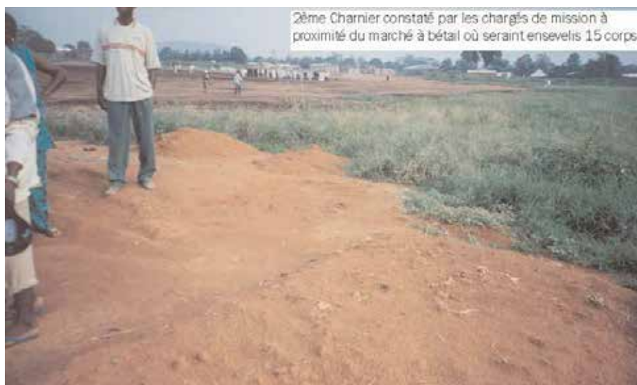
Second mass grave observed by FIDH representatives near the cattle market where 15 bodies were buried.

"On October 31st I saw a military-type truck on the road to the Saint Charles school and it stopped. There were 16 Fulanis (Peuls) in the truck and a soldier ordered them to get down. There were a lot of armed soldiers and the Fulanis were barechested. They had shoes and were not chained (...). That's when the soldiers shot them over and over again in the back. The men collapsed."