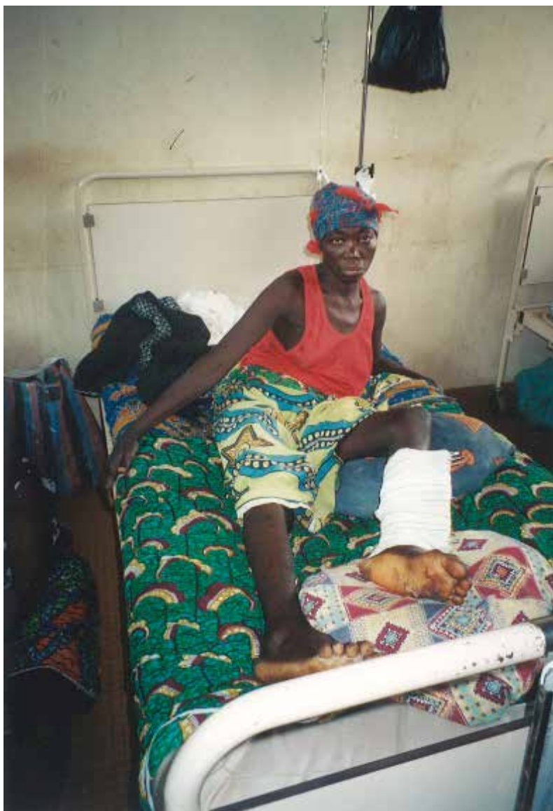
Woman, victim of sexual violence being treated at the Bangui hospital.

"I am 15 years old and live in PK12. On Friday November 1st, 2002, armed men in combat uniform came to our house. I was sleeping in the room with my sister. All of a sudden they broke down the door. They asked us for money and jewelry and gold. My sister said that we didn't have any money. One of the men dragged my sister into the shower. She started yelling. We ran to her. The man pointed his gun at us, while he was on top of her. He ordered us to go back into the living room, which we did because we were afraid. Then a big, fat young man turned to me. He tore my panties. He threw me on the floor. He took off his pants. He stuck his penis into me. He hurt me very badly. I saw a lot of blood on my pagne (loincloth). My belly still hurts. He spoke Lingala, and very poor French."