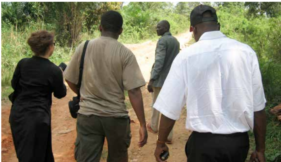
Fact-finding mission of the FIDH in CAR.

In 2006, FIDH carried out another mission to collect the testimonies of the numerous victims and witnesses of sexual violence, thus confirming the systematic character of this violence. FIDH also conducted an investigation that showed that the CAR judicial and political authorities had neither the will nor the capacity to fight the impunity of the perpetrators of the crimes committed in 2002 and 2003.