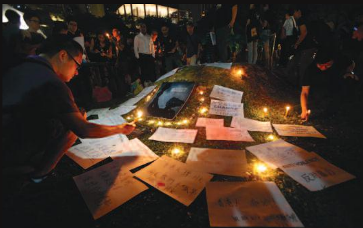
People light candles next to signs at a vigil in solidarity with protesters of the “Occupy Central” movement in Hong Kong, at Speakers’ Corner in Hong Lim Park, Singapore, on October 1, 2014.

Human Rights Watch calls on Singapore’s government to drop all pending charges and investigations against those being prosecuted for the exercise of their freedom of expression or their right to participate in peaceful assemblies, and amend or repeal relevant laws to bring them into line with international human rights standards.