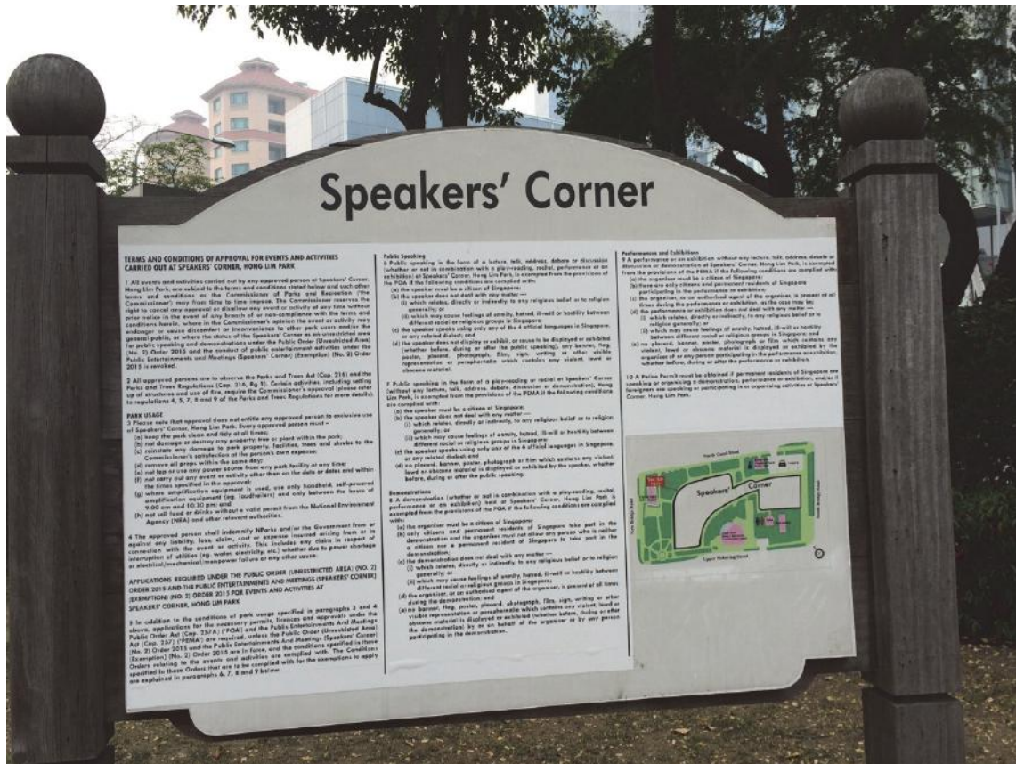
A list of terms and conditions of approval for events and activities at Speakers' Corner, in Hong Lim Park, Singapore.