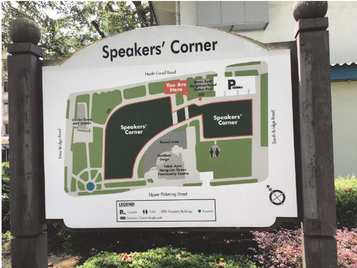
A map of Speakers' Corner, in Hong Lim Park, Singapore.

“participate” in any “assembly or procession.” 277 Non-citizens who “participate” in an assembly or procession face a fine of up to S$3,000, and organizers who permit participation of non-citizens face up to six months in jail or a fine of up to S$10,000. The rules do not define “participation,” but the police have made clear that the mere presence of a non-citizen at an assembly will be treated as participation and thus in violation of the law. 278 Prohibiting non-citizens from even entering the venue means that, where a family includes both a Singapore citizen and a non-Singapore citizen, the non-Singapore citizen is prevented from even observing, much less participating in, the event. 279