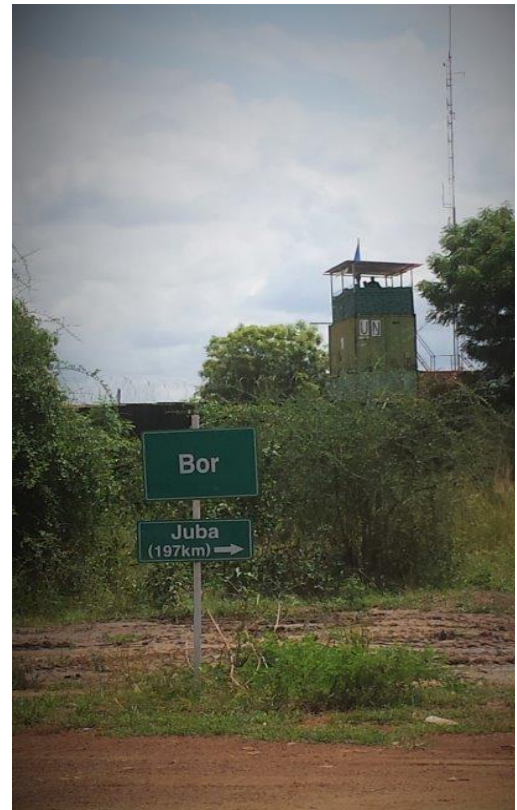
UN Base in Bor

Our interviews show, that this is not just creating internal problems within the UN but is also recognised by civilians and seen as problematic on the ground. Not only is it damaging the reputation of the mission, but it has created an environment in which civilians hope that UNMISS will protect them, but are not sure whether or not they will: they believe that their protection is contingent upon which particular peacekeepers are present should an incident take place. Therefore, there is a clear need for civilians to know exactly what they can expect from the peacekeepers; and the peacekeepers need to be held accountable to the civilian population as well as to the UN for any failure to carry out their mandate. 47