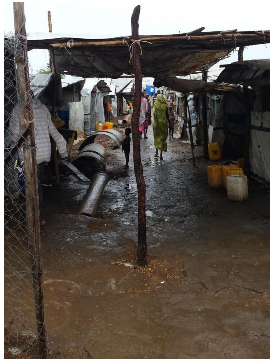
PoC site

Clearly, this is a difficult maze to navigate. However, UNMISS could improve the situation by convening stakeholders in a regular discussion forum. At a minimum, creating a regular space for discussion would likely help key actors to form a consensus view on the obstacles to allowing people to exit the PoC sites and could create joint strategies for addressing them. Articulating principles for return could reassure stakeholders that any actions taken would respect the rights of camp residents; while reinforcing the flow of information and facilitating “go and see” visits to home