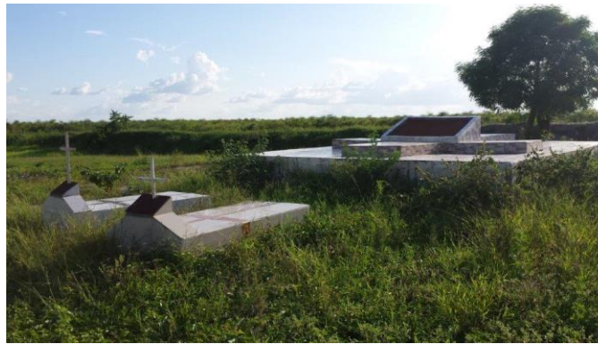
Graves of those killed in church attack

In a context in which people are living largely isolated within the camps, the findings showed that the memory of specific atrocities plays a dominant role in people’s understanding of their broader security situation. Given the nature of the conflict and the appalling toll it has taken on civilians, it was not surprising that many of those within the camps had appalling stories to tell of atrocities they had witnessed or heard about. As one man said, “In March in Unity State the government castrated 25 boys. They want to wipe out Nuer.” 67 Another man told of how he had seen some of his relatives killed: “In Juba my brother in law, a Brigadier, and my son were both called out and shot. My son survived and is in Juba PoC.” 68