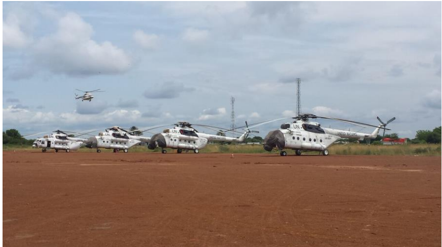
UNMISS helicopters, Bor airstrip

As a result, concerns have repeatedly been raised by local civil society and the international community over the ability of UNMISS to cope with the impact of this ever-changing and complex war on its mandate, including the protection of civilians. As the conflict has evolved, it has become increasingly clear that UNMISS has been “overwhelmed by the scale of conflict and, racing to manage each new challenge without adequate resources or holistic plans.” 24 A number of actors have already critiqued the mission.