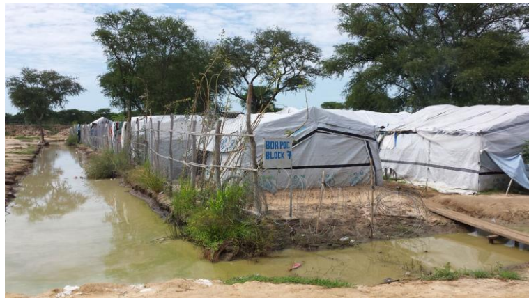
Bor PoC Camp

While those interviewed within the PoC sites were clearly grateful to UNMISS for providing immediate protection, two years later they were more ambivalent in their support for them as a longer term form of protection. Increasingly, they recognise that the hard perimeters of the camps are creating a number of unintended consequences. Increasingly, some of the perils associated with camps in other contexts of displacement – perils that have been recognised, at least at a policy level, through the de-emphasising of camps as the default response to situations of displacement 86 – appear to be accentuated by the specific nature of the PoC camps.