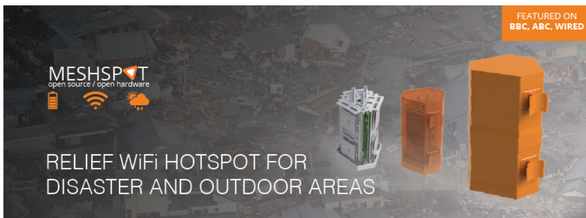
A promotional poster for "Meshpoint" WiFi hotspots.

during integration). Some designs have not been long-term in scope. Others have, crucially, lacked proper consultation and collaboration with other actors, not least displaced or migrant communities themselves, to "improve collective understanding of what is feasible, legal, and has the greatest potential to improve refugees' lives." 43 An explosion in imagined tech solutions created duplicated, short-lived "solutions" and apps created without proper regard for the communities concerned. While social media has been presented as everything from phenomenon to lifeline to threat, many of the problem-solving and solutions envisaged for this "crisis" have come from European or Europe-based initiatives, which—some argue—have not always been undertaken with the refugee or migrant's needs in mind. Human-centred design is arguably the best way to understand a target population and this point, made emphatically by Benton and Glennie, reminds us of the importance of sober, accurate analysis that is informed and guided by migrant populations themselves.