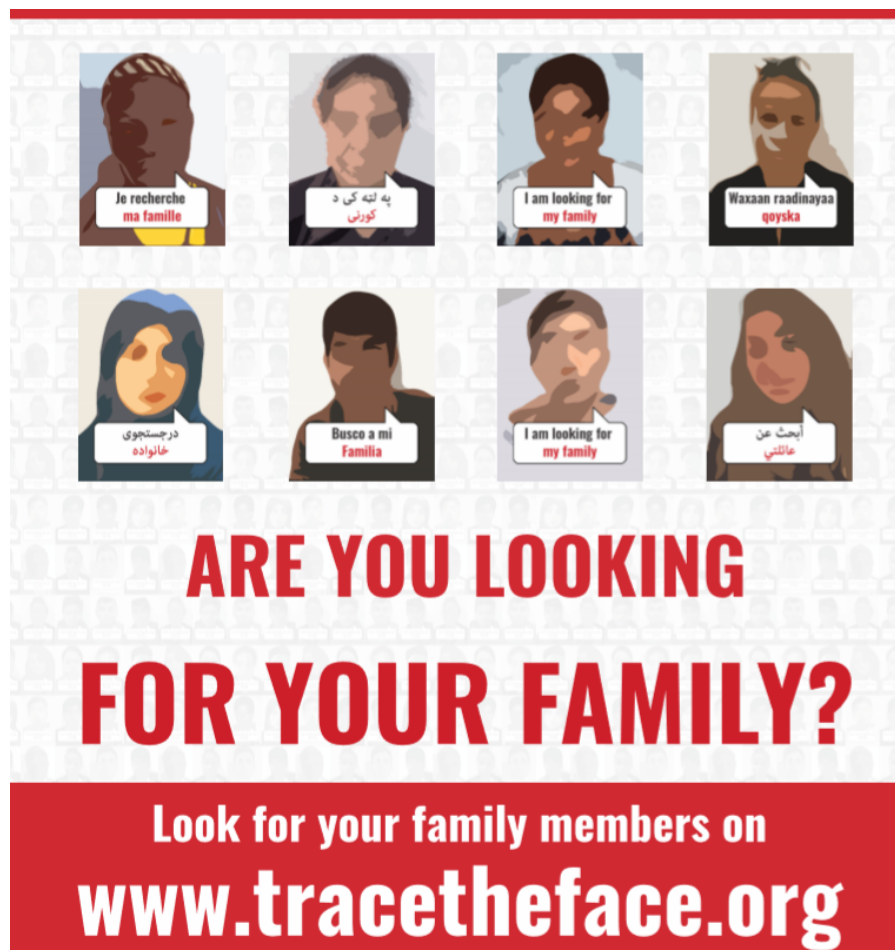
A poster for the ICRC's "Trace the Face" initiative.

A wave of new initiatives has been launched in the past few years. And yet laudable as this wave of "digital humanitarianism" might have been, there appears to have been a relative lack of organised innovation (particularly in assisting new arrivals