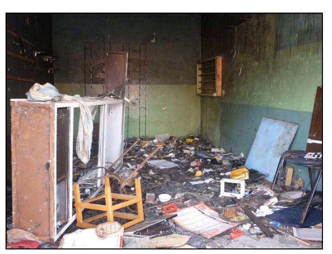
Building burned by Moroccan residents

The protesters were complaining that, though indigenous to Western Sahara, they are discriminated against by the Moroccan authorities and do not receive a fair share of the wealth and other benefits deriving from the region's natural resources and land, and that the local authorities have failed to address their socio-economic grievances.