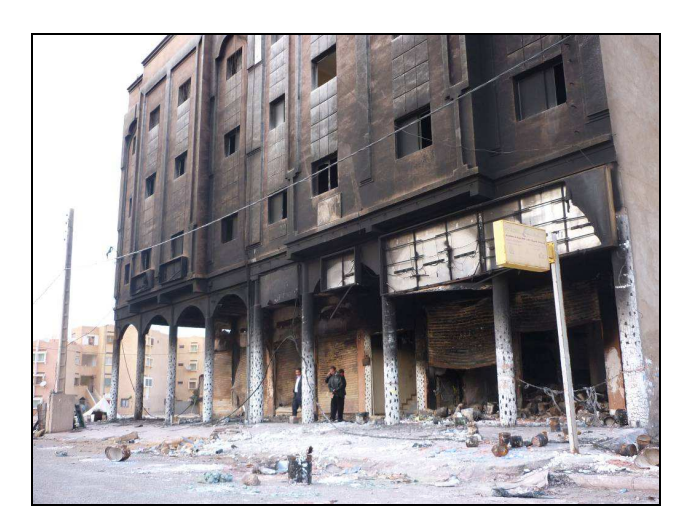
Building burned by Sahrawi protesters

Violent confrontations broke out in the early morning of 8 November 2010 in the desert a few kilometres east of the town of Laayoune, in the Moroccan-administered Western Sahara, when Moroccan security forces sought to forcibly remove people from a tented "protest camp." The Gdim Izik camp had been set up in early October by Sahrawis protesting against their perceived marginalization and demanding jobs and adequate housing.<sup>1</sup>