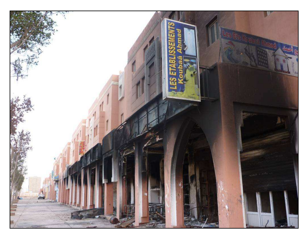
Building burned by Sahrawi protesters

A doctor whose private medical practice and apartment were located above the Arcol paint company had both destroyed by fire; the fire devastated the company on the ground floor and badly damaged the upper floor of the building. The doctor told Amnesty International that he was absent when the building was set on fire and returned to find everything destroyed or damaged beyond repair.