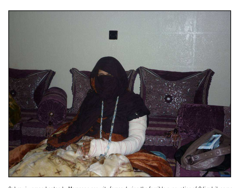
Sahrawi woman beaten by Moroccan security forces during the forcible evacuation of Gdim Izik camp

The dismantling of the camp by the security forces was accompanied by considerable violence. Sahrawi protesters who were at the camp told Amnesty International that members of the Moroccan security forces had beaten them with batons and torn down their tents to force them to leave and vacate the area. However, there was clearly serious resistance by at least some of those present in the camp, with the result that nine members of the security forces were killed by Sahrawi protesters in circumstances that have yet to become fully clear but in at least a number of cases resulted from stab wounds. In a video recording Sahrawi protesters can be seen repeatedly hitting a member of the security forces lying on the ground injured or dead. Amnesty International deplores and condemns such actions.<sup>2</sup>