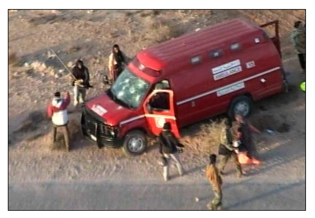
Firefighters' ambulance being attacked by Sahrawi protesters

Laayoune then saw another bout of violence later on 8 November when Moroccan residents, in turn, attacked Sahrawi homes and businesses, damaging, looting or setting fire to property and vehicles, and in some cases beating Sahrawi residents. Victims of these attacks allege that Moroccan security forces were present in some cases and either failed to intervene or actually participated in attacks alongside Moroccan residents.