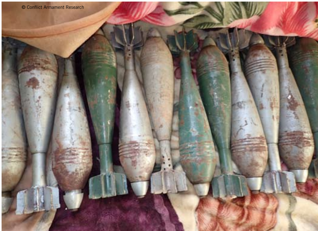
Improvised mortar rounds manufactured by IS forces and captured by Syrian Kurdish People's Protection Units documented by a Conflict Armament Research Field Investigation team on 21 February 2015 in Kobane.

IS captured an unknown quantity of 155mm M198 towed howitzers from Iraqi military stocks during its capture of Mosul in June 2014, along with the older Chinese Type 59-1, which the Iraqi army used extensively during the 1980-1988 Iran-Iraq war. 23 IS has also captured former Soviet Union D-30 and M-30 122mm howitzers from Syrian military stocks and small numbers of the older, and now obsolete, M-30 models which were probably taken from the Syrian army's reserve storage for deployment.