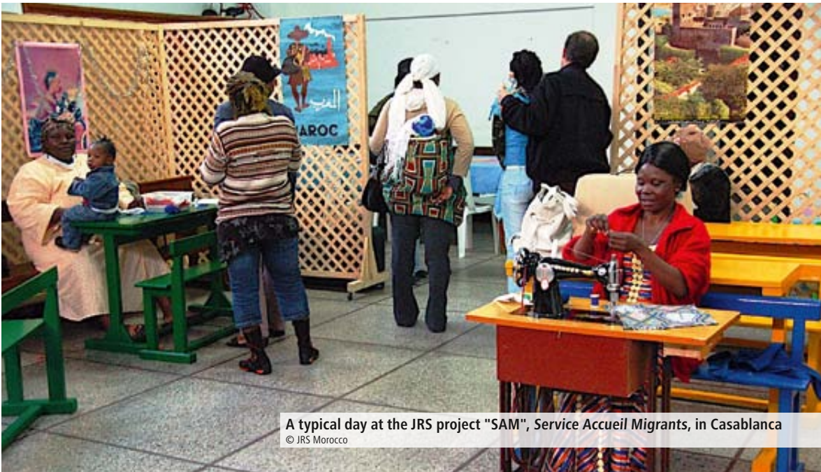
A typical day at the JRS project "SAM", Service Accueil Migrants, in Casablanca

“Shots were being fired in the streets and violence was all around us,” she recalls. “Armed people started entering houses, specifically targeting politically active persons. My family were also targets so we stayed indoors for a number of days hoping to remain safe. After some time, our food finished so I was forced to leave the home in search of food and drink as we had started to starve. I took my two daughters with me and left my husband and son behind. When I got back home, I saw the door open and bullet marks all over the house. I knew that something terrible had happened and ran inside. My husband and son were lying on the ground. I was desperate and started to scream for help. My little daughters were crying next to me. We managed to get a