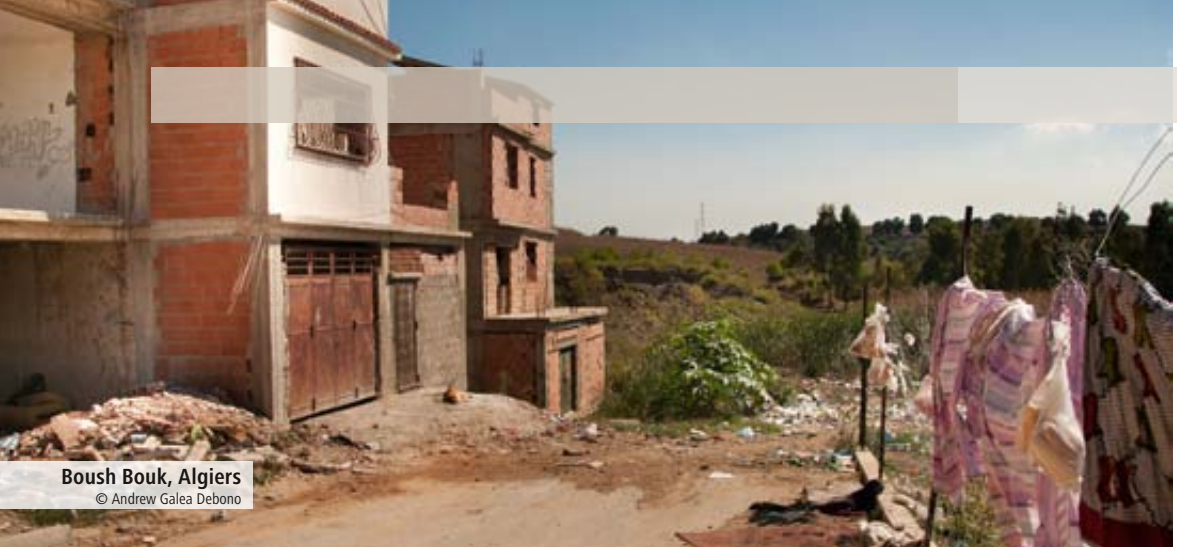
Boush Bouk, Algiers