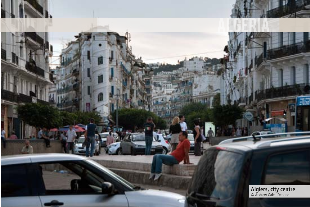
Algiers, city centre

of their travel, but they don't listen. Everyone believes that their luck will be different. They also barely listen when told that about one person in every ten who tries to cross to Europe by boat drowns. "It will not happen to me", says one young man who still dreams of crossing over to Europe. "God is with me and will protect me". Few are ready to let go of their dreams even in the face of harsh realities faced by those who tried the same thing before them. For others, going back home would be a great humiliation even if staying means remaining in an exile of misery for a few more years.