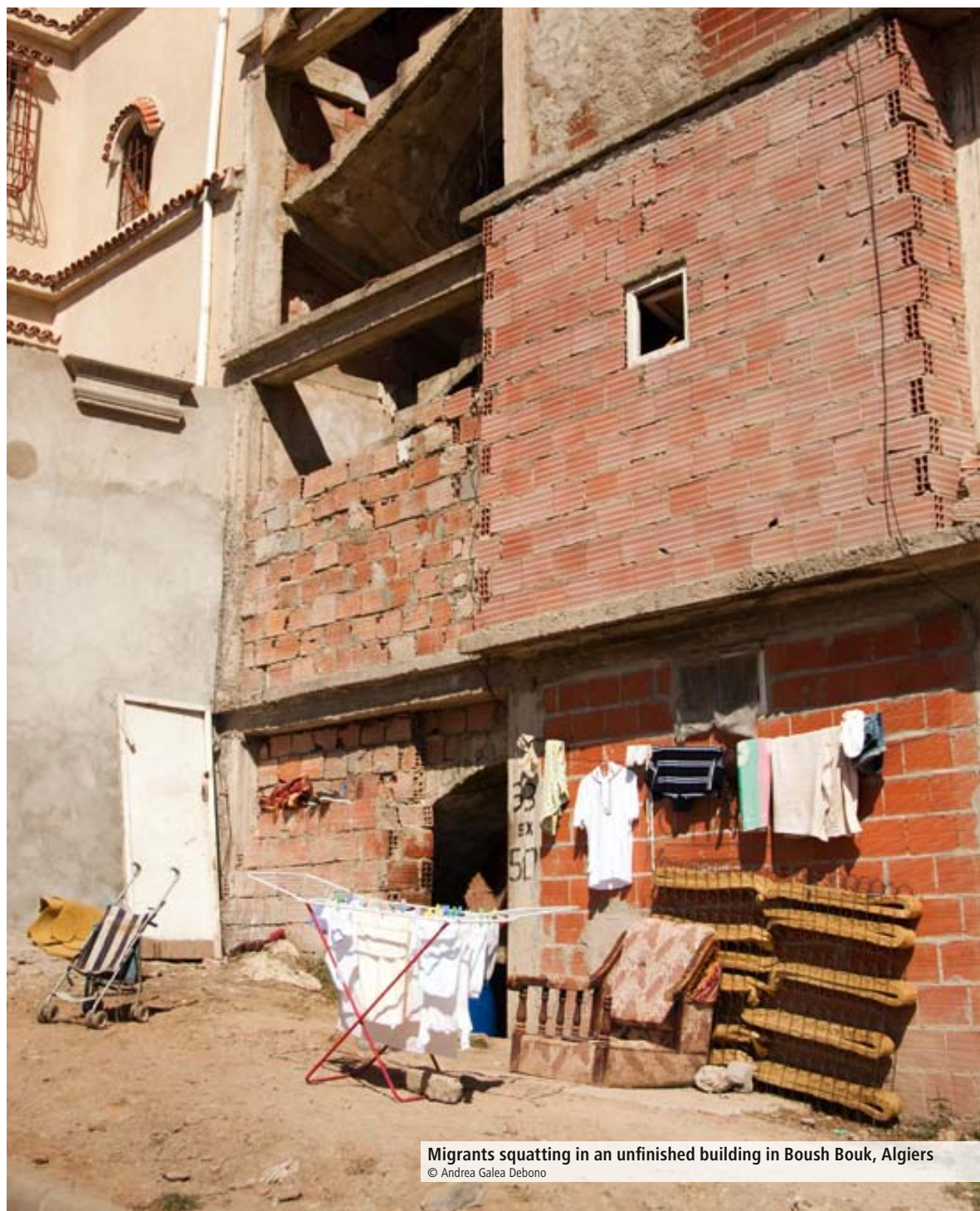
Migrants squatting in an unfinished building in Boush Bouk, Algiers