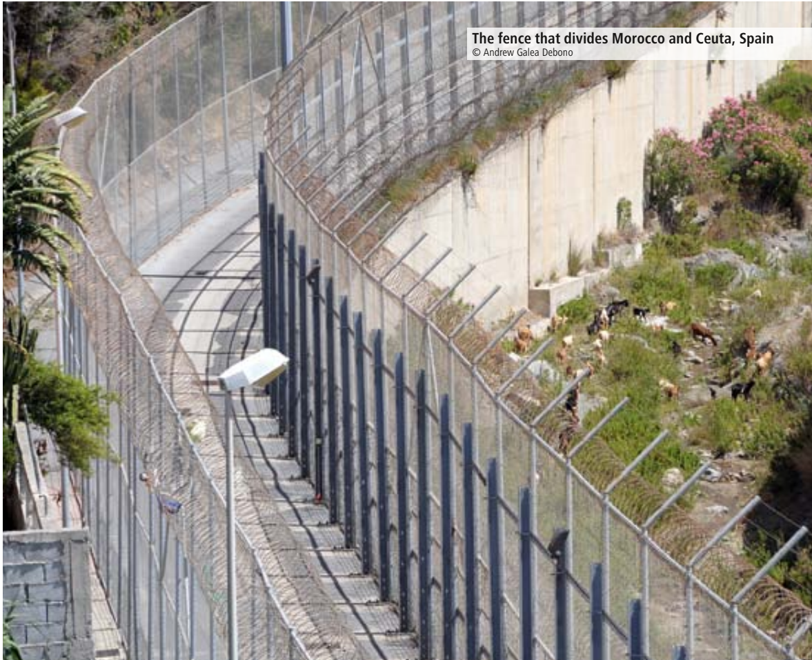
The fence that divides Morocco and Ceuta, Spain