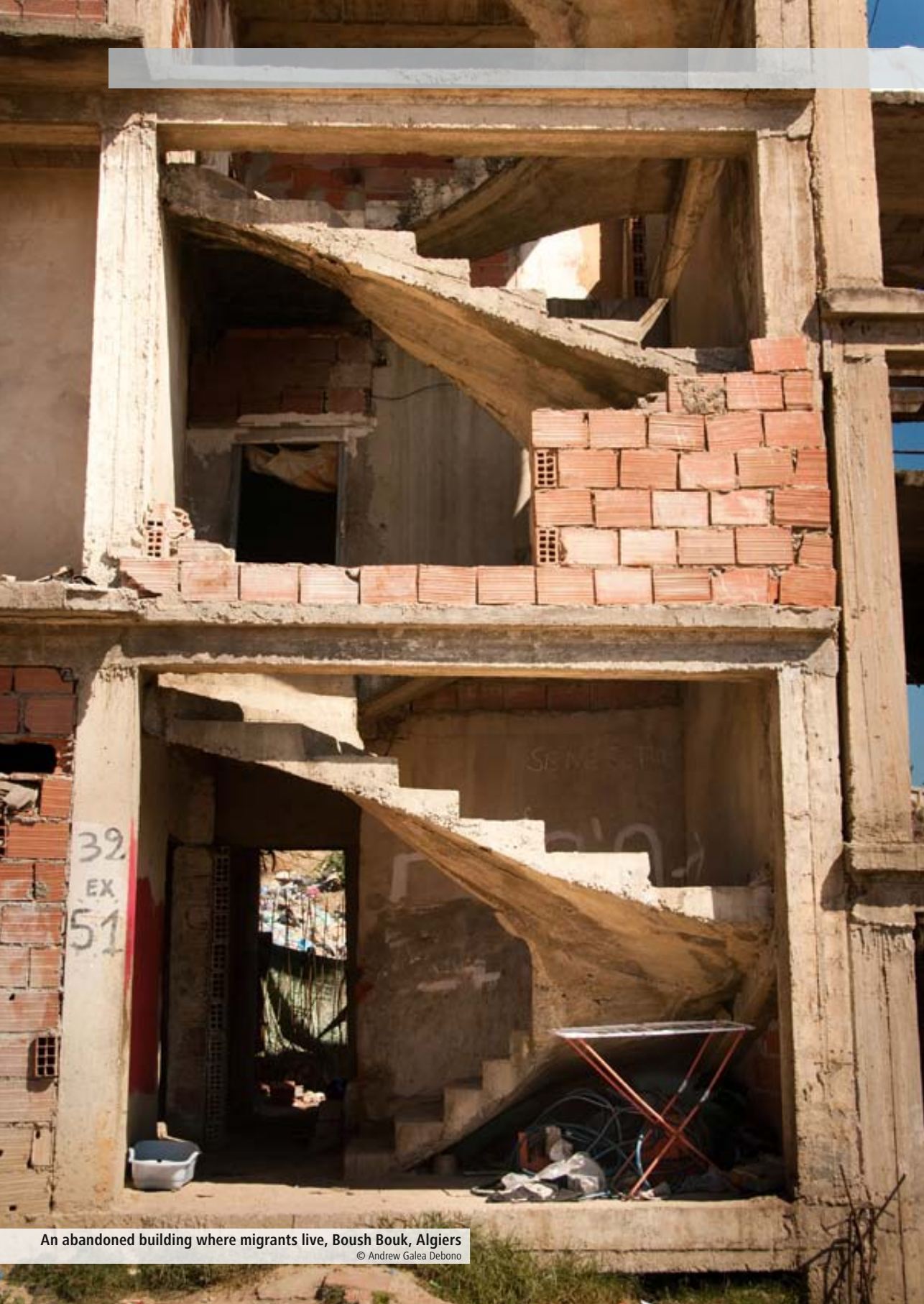
An abandoned building where migrants live, Boush Bouk, Algiers