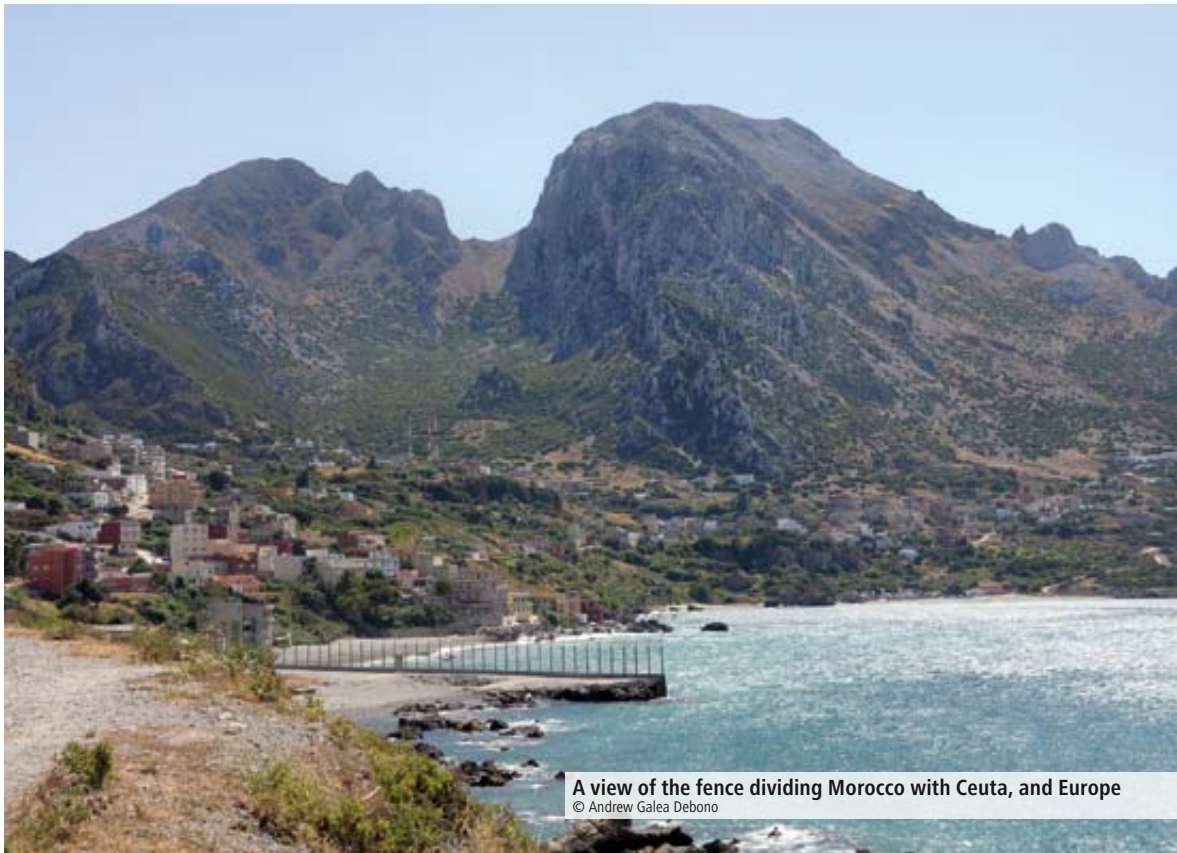
A view of the fence dividing Morocco with Ceuta, and Europe