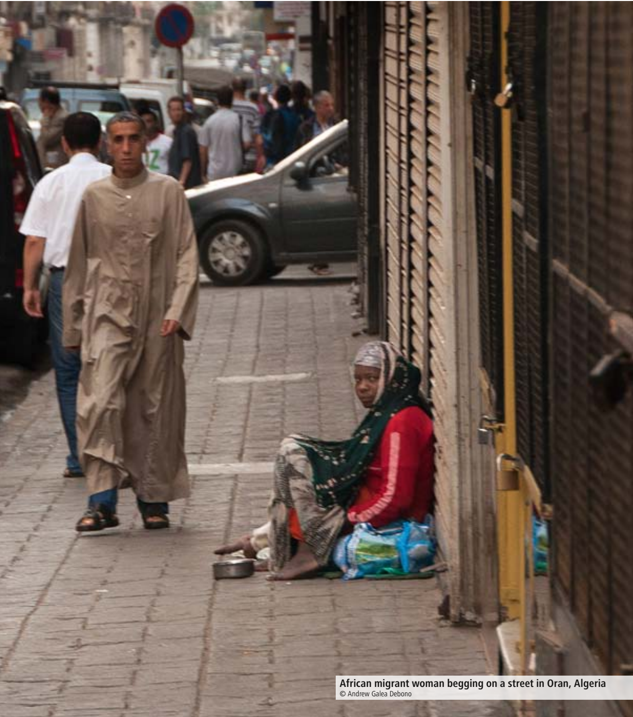
African migrant woman begging on a street in Oran, Algeria