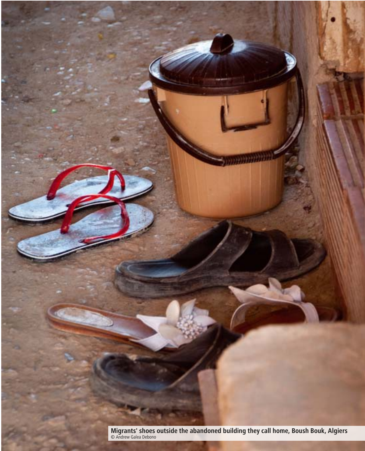
Migrants' shoes outside the abandoned building they call home, Boush Bouk, Algiers