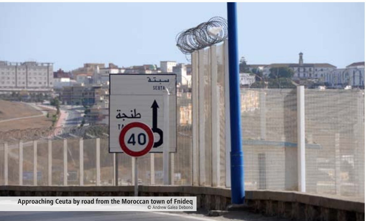
Approaching Ceuta by road from the Moroccan town of Fnideq

Those few who eventually make it to Ceuta are not greeted by riches or an easy life, but at least they hope that finally they will have their basic rights respected and more prospects to build a life than they had before. Once people are in Ceuta, they can apply for asylum. They are transferred to the immigration holding centre ( Centro de Estancia Temporal de Immigrantes, CETI ) but not all are then transferred to mainland Spain, with cases of people stuck in the tiny territory of Ceuta for over a year and even longer. This situation has led some migrants to call Ceuta a “sweet prison”.