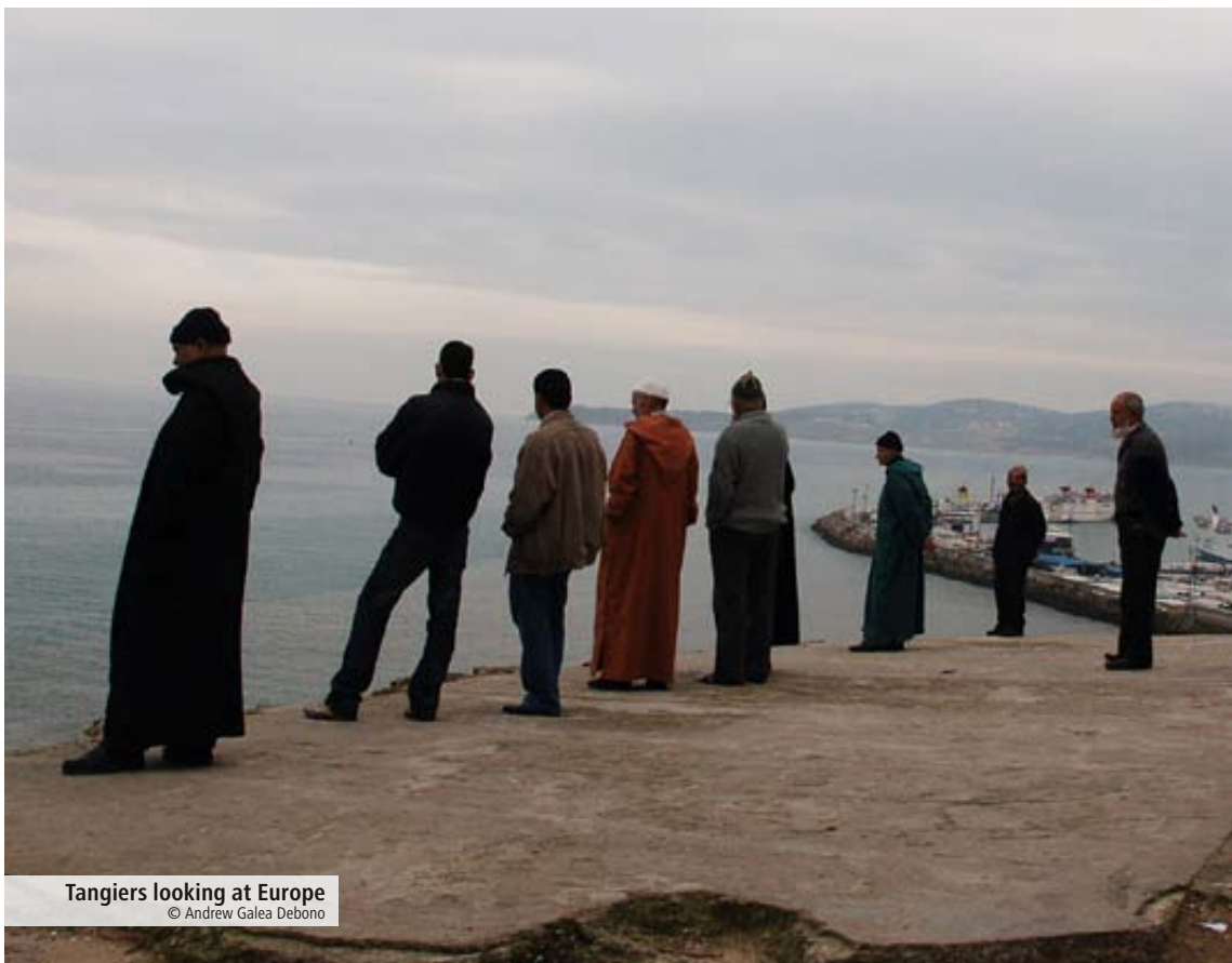
Tangiers looking at Europe