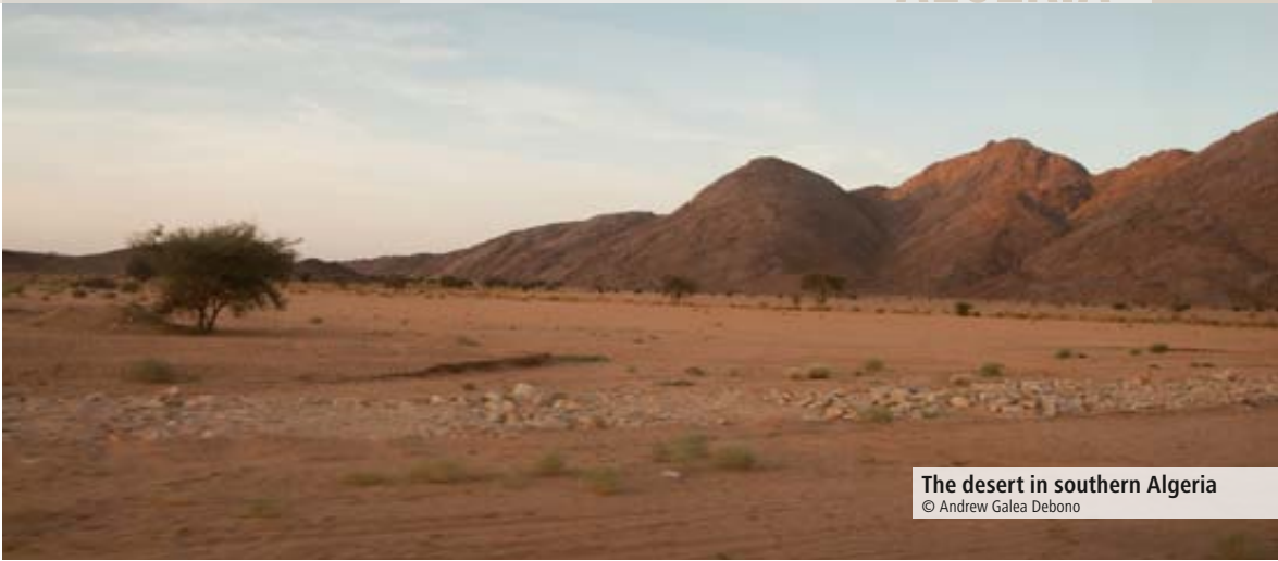
The desert in southern Algeria