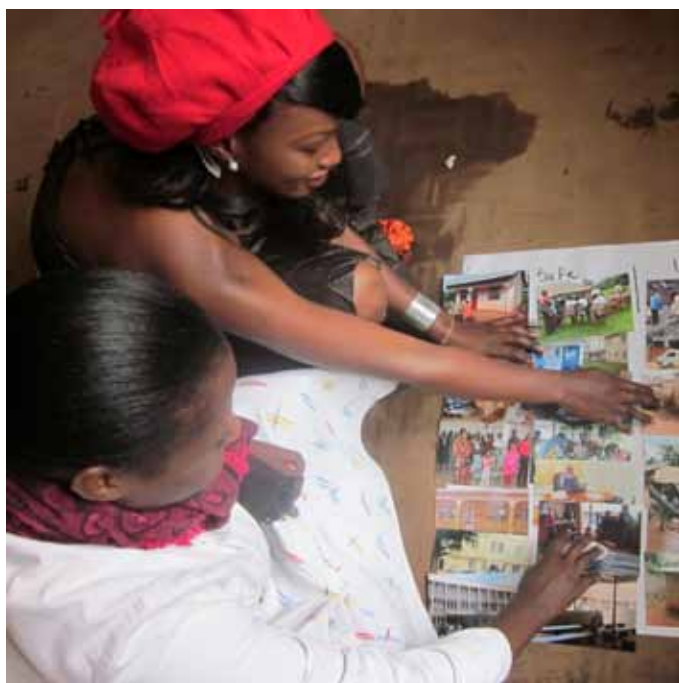
Data collectors re-creating the safety map as developed by group participants.