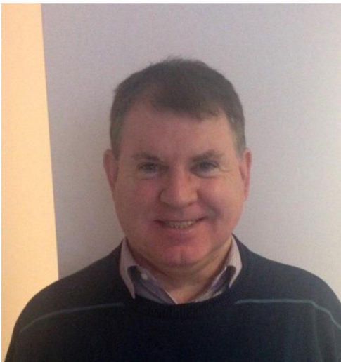
David Goggins, Refugee Documentation Centre