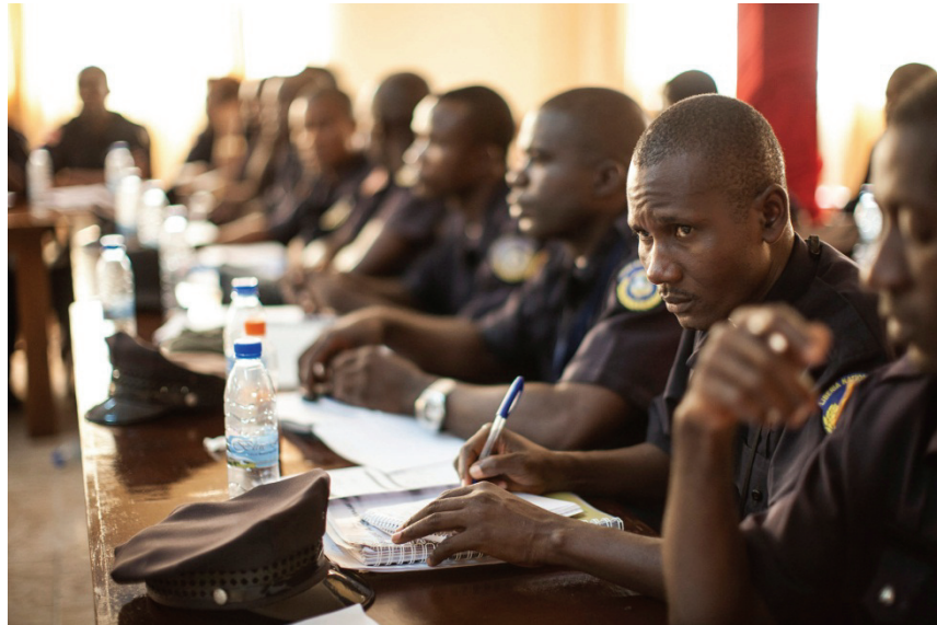
Officers attending a training provided by the Norwegian Refugee Council in Monrovia, May 2010.

While UNPOL was initially heavily involved in vetting police officers, it now primarily serves as an advisory and monitoring force that also plays a substantial role in filling LNP resource gaps. 17 UNPOL monitoring can be credited with reducing the number of arbitrary