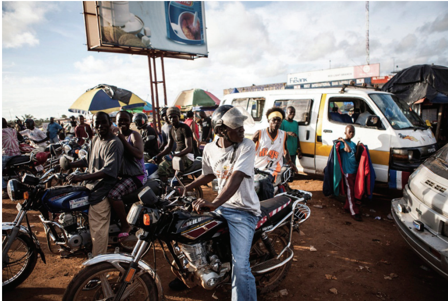
Motorcycle taxi drivers wait for customers in Red Light, Monrovia.

Motorcycle taxis have been an important source of income for young men who have low levels of education or have lost family in the wars. A number of them are ex-combatants from the civil wars: the motorcycle drivers union estimates that 25 percent of motorcycle taxi drivers are former fighters. 96 The motorcycle is how they sustain themselves and their families financially. 97