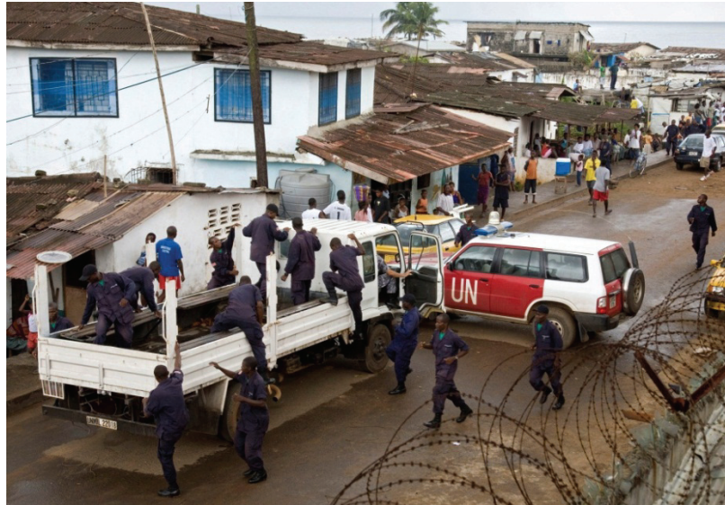
United Nations troops and the newly trained Liberian police force fan out in a neighborhood in Monrovia on September 14 2006, in an effort to quell increased crime in the city.

The United States completely demobilized the AFL in order to recruit, vet, and train an entirely new military, whereas the UN relied on a vetting procedure to identify which police officers could continue in the force and to select eligible new recruits. United Nations Police (UNPOL) faced a number of challenges in recruiting, vetting, and training the new LNP, which undermined its ability to effectively identify and weed out abusive and corrupt officers. 6