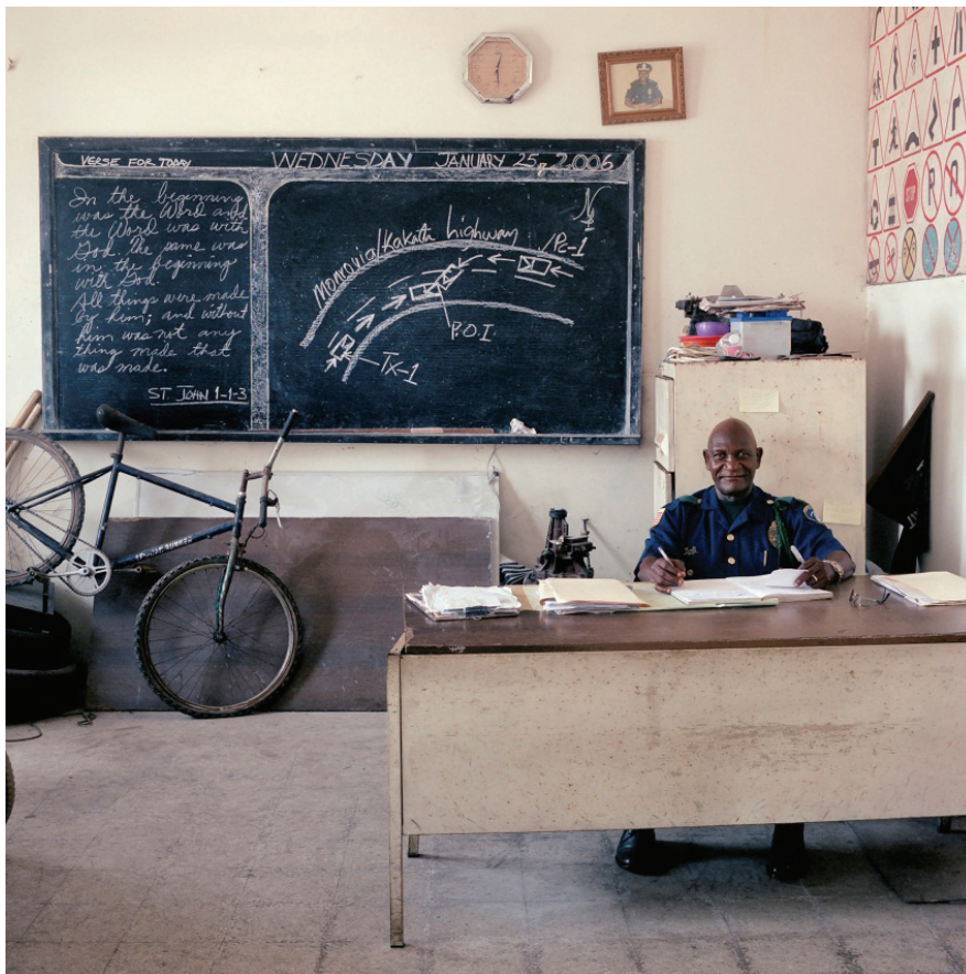
Police officer in the Reconstruction Room of the Traffic Police at the Liberia National Police Headquarters in Monrovia.

I feel so bad about it. Once I choose a career, I have to live with it. But as a human, I feel hurt. We love our country. We try to do our best to do the work.... In Liberia, police officers and teachers are the least. 135