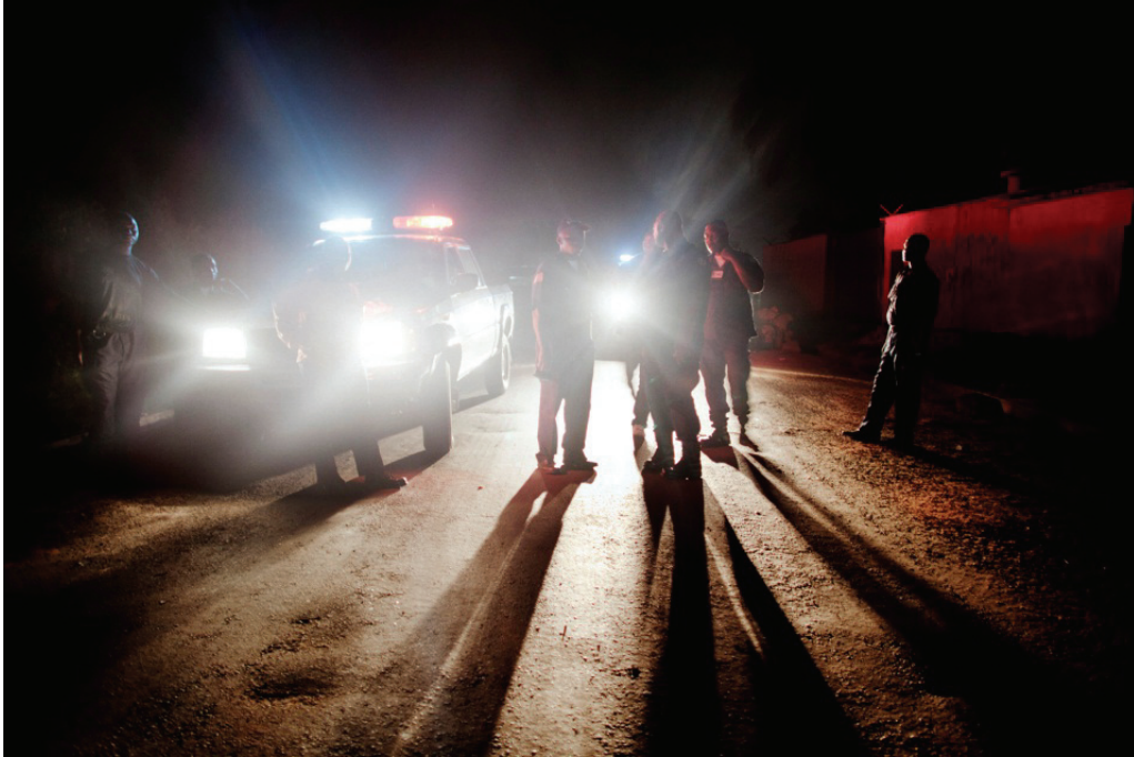
Police officers on nighttime patrol in Monrovia, Liberia.

The PSU, and sometimes the ERU, patrol Monrovia's impoverished West Point area at night and harass those found outside their homes. One man said that in October 2012 PSU officers robbed him and his wife at night outside their West Point home. The officers kicked him, held his wife at gunpoint, and seized money from her bra, he said. 76 The officers made off with their money and phones.