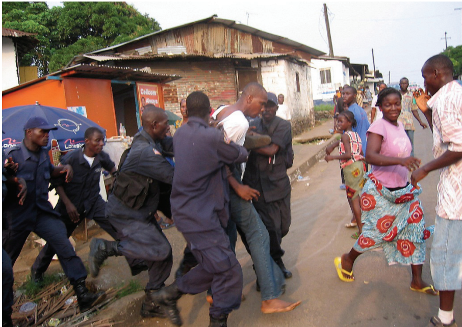
Police officers conducting an arrest in Monrovia, Liberia September 2006.

The government of Liberia has repeatedly acknowledged the links between human rights, a professionalized security sector, and human development. These links were seen most clearly in President Sirleaf's Poverty Reduction Strategy (PRS) from her first term. This strategy underscored the critical role that the security sector plays in Liberia's recovery and lasting peace: two of the four pillars of the strategy were security and rule of law (the other two were economic revitalization and infrastructure/basic services). 39