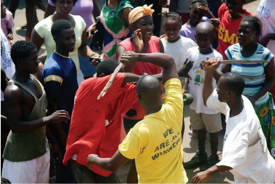
A young man is beaten with sticks after being accused of attempted theft in Monrovia, February 2007.