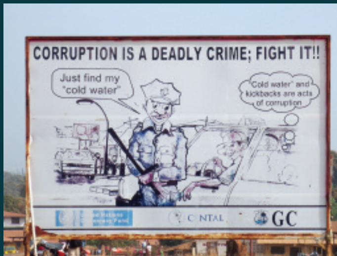
Anti-corruption poster in Gbarnga, Bong, Liberia.

To strengthen respect for basic rights and the rule of law in Liberia, Human Rights Watch calls on the Liberian government to bolster police accountability mechanisms and fulfill its promise of establishing an independent oversight board for the police. In addition, the government and foreign donors should investigate persistent logistics shortfalls that contribute to police officers preying upon the public for material support. Finally, government officials in Liberia should emphasize accountability and good governance in the security sector as essential to the country’s promised post-conflict development.