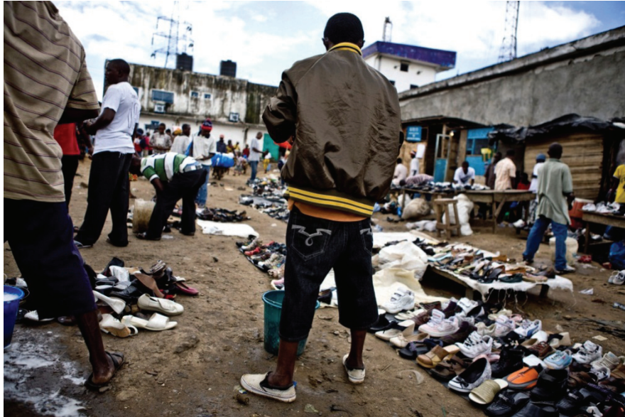
Street vendors arrange their goods for sale in Red Light, a market district in Monrovia.

A couple of street vendors noted that, when they could not pay the bribe, police officers took a portion of their goods as in-kind payment. More often, street vendors said that the police throw the goods in a plastic bag, or sometimes simply leave the goods loose in the pickup, and carry the goods to the police station. One street vendor described a recent raid: