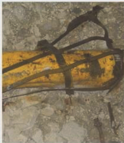
Karm al-Jazmati, Aleppo, November 23, 2016