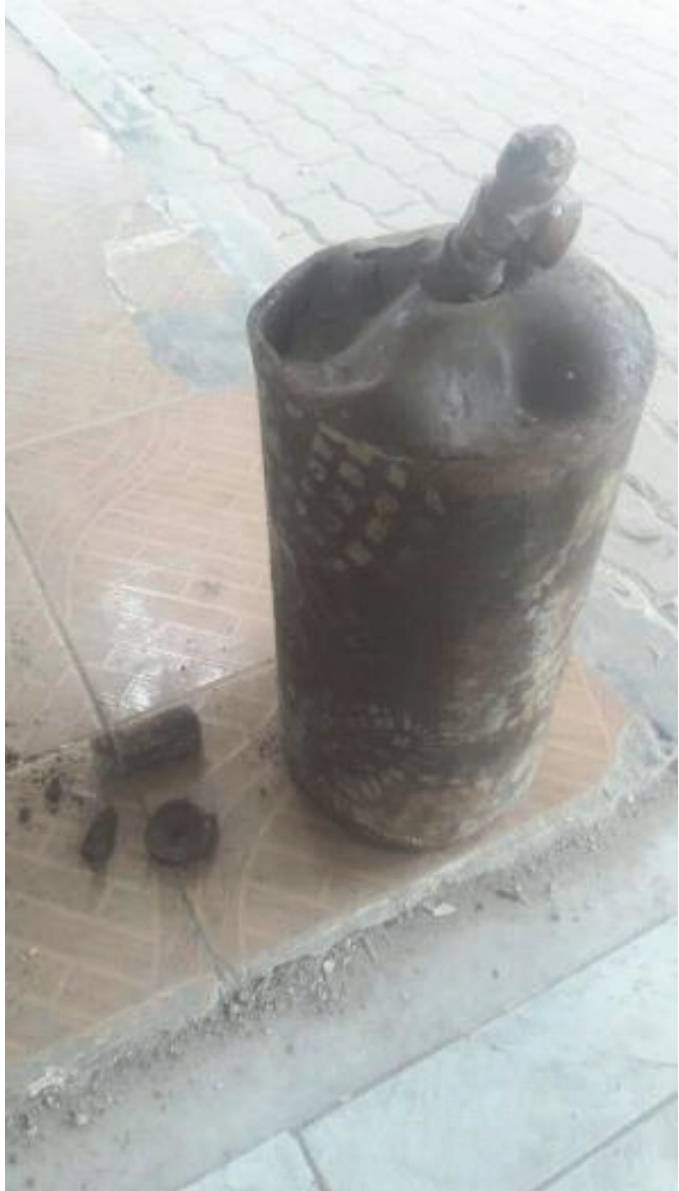
Deformed gas cylinder that a Syria Civil Defense member said was found at the site of a March 29 attack in the Qaboun neighborhood in eastern Damascus, which is controlled by armed groups fighting the government.

On February 9 and 10, 2017, at least six members of an armed group were injured from exposure to chlorine, according to a