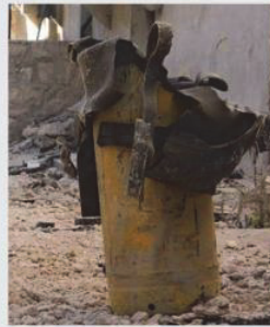
Masaken Hanano, Aleppo, November 18, 2016

During the final weeks of the battle for Aleppo, Syrian government helicopters repeatedly dropped gas cylinders filled with chlorine, affecting hundreds of civilians. Journalists, first responders and activists photographed and filmed remnants from at least seven yellow cylinders in different locations.