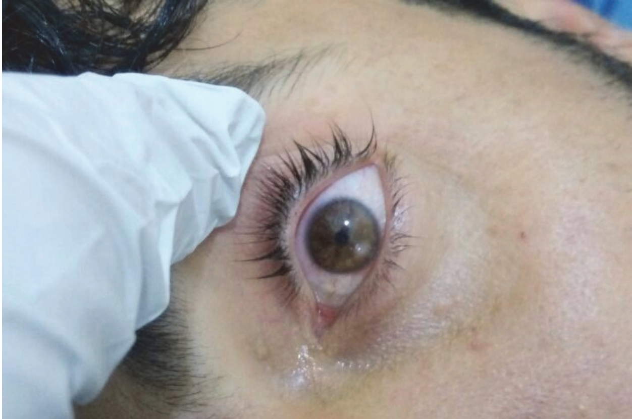
Severely constricted (“pinpoint”) pupil of a man injured in attack near al-Lataminah on March 30 according to the Syrian American Medical Society.

The Syrian American Medical Society (SAMS) provided a photo that it said was of one of those injured in the March 30 attack on al-Lataminah. The photo shows that the man has severely constricted (“pinpoint”) pupils.