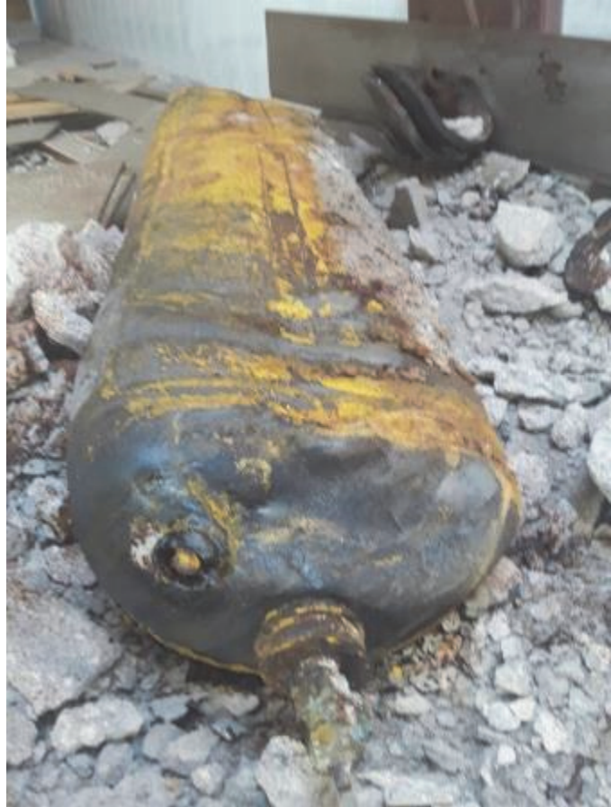
Remnant of yellow gas cylinder that struck a make-shift hospital in al-Lataminah on March 25, 2017 according to a Syria Civil Defense member.

While witnesses gave different information as to how many gas cylinders struck the hospital and surrounding area, there are photos of at least two different cylinders. Munaf al-Saleh from Syria Civil Defense shared a photo of a deformed yellow gas cylinder that he said was the one that had hit the hospital roof. 22 A reverse image search indicated that the photo had not been published online anywhere before.