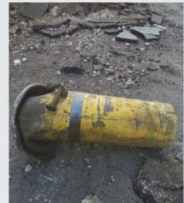
Found in Bustan al-Qasr, Aleppo, on December 10, 2016

of fluid in the lungs. The sensation would be similar to that of drowning. High levels of chlorine exposure can be deadly.