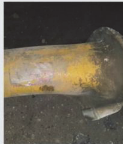
Found in Aleppo on December 8, 2016