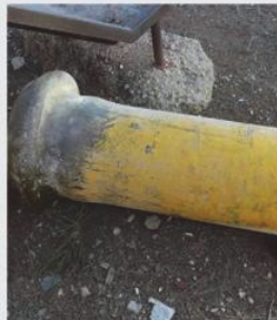
Karm al-Qaterji, Aleppo, November 28, 2016