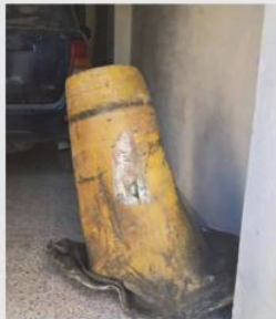
Tariq al-Bab, Aleppo, November 20, 2016