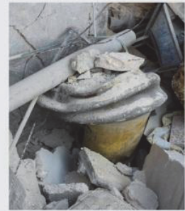
Al-Sakhour, Aleppo, November 20, 2016