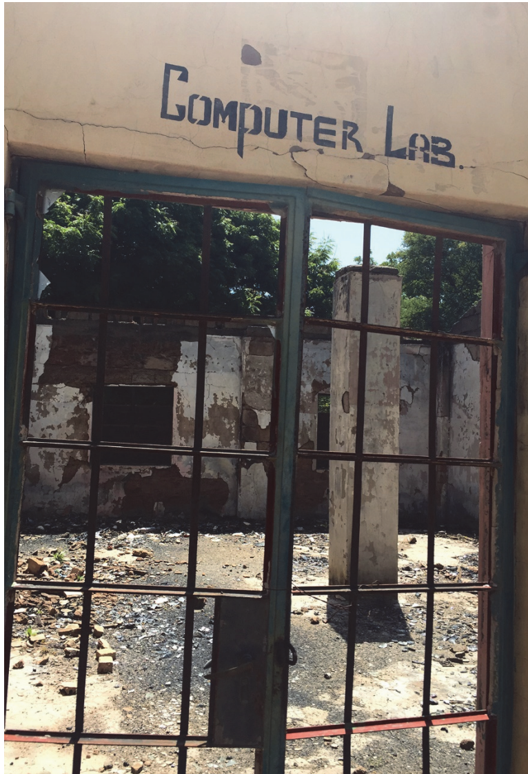
Computers and a computer lab supplied by a project for the Millennium Development Goals are destroyed when Boko Haram attacked Nahuta Primary School in Potiskum, Yobe state.

the local education authority office, and at least eight schools including Race Course Primary School, Nahuta Primary School, Sabon Layi Primary School, Government Day Junior Secondary School, College of Administrative and Business Studies, and Best Center Vocational School. 67