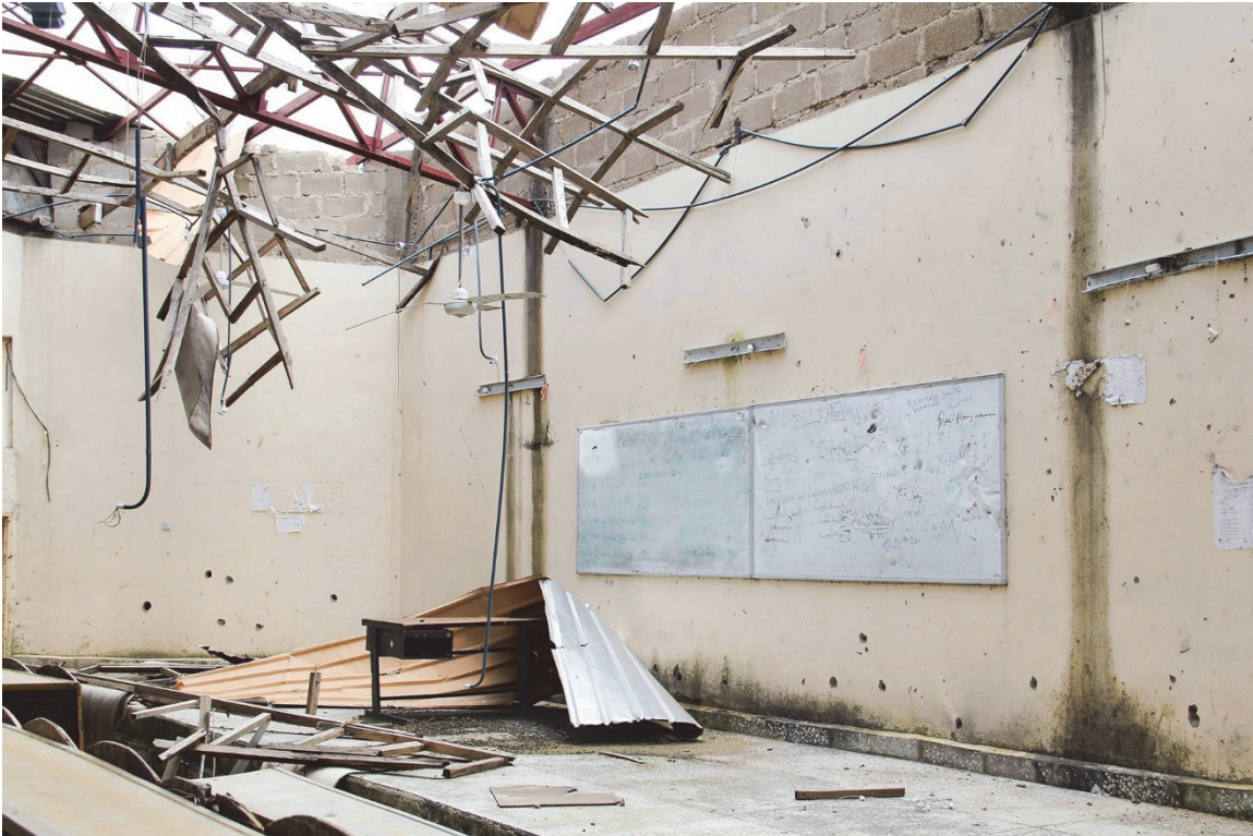
A lecture theatre at the Federal College of Education, Kano, Kano state, destroyed when Boko Haram insurgents lobbed grenades and shot students taking classes on September 17, 2014. At least 27 students and two lecturers were killed in the attack.

caused by the massive crackdown on its members by security forces in late 2012, the group embarked on large-scale recruitment of students and others using hefty financial rewards as enticement and brutal force. 54 The recruitment was accompanied by killings of those who refused or who attempted to evade capture.