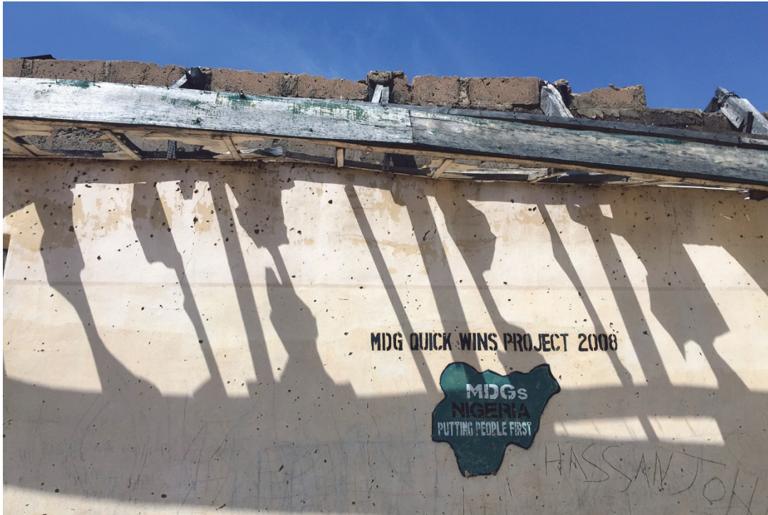
A block of classrooms at Nahuta Primary School, Potiskum donated as part of a project for the Millennium Development Goals was destroyed during Boko Haram attacks in Potiskum, Yobe state, in October 2012.

Between June and October 2012, schools in Damagun, Damaturu and Potiskum, Yobe state, bore the brunt of Boko Haram attacks. 64 Yobe Children’s Academy was the first private school to be attacked in Damaturu. On the night of July 22, insurgents burned 32 classrooms and nine offices in the primary and secondary section. 65 A teacher working late in the office was shot and killed after being forced to show the insurgents around the school. 66