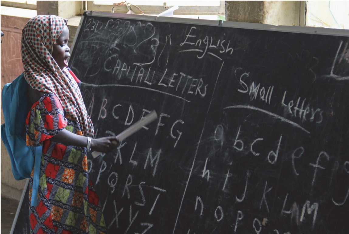
An eager student leads her class in learning the alphabet in September 2015 at a displacement camp housed at a school in Maiduguri, Borno state.

Our education secretary arranged us. Told us that these children running about all day doing nothing is not so great. So we must go and teach them. We are just managing. ...Some of the students are too small. Some are having 5 years to 6.5 years..... 248