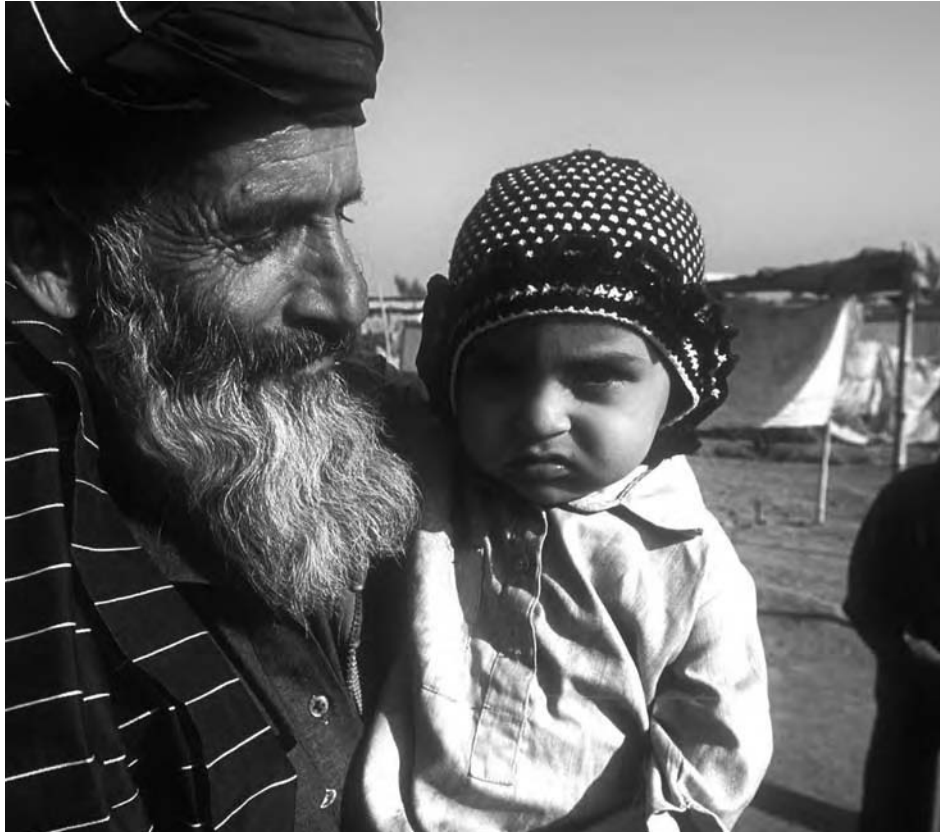
Pakistan 2001, WHO

The differences between older men's and women's lives highlight the need to recognize gender implications across the lifespan. Although considerable attention has focused on women in disasters and conflicts, this has tended to focus on younger generations, with particular attention given to education of girls, maternal health and sexual violence. Older women have remained a peripheral concern, despite the facts that they are more likely to be widowed, to experience chronic health problems and to face exclusion. Planners and emergency workers must consider these issues among older female refugees and survivors.