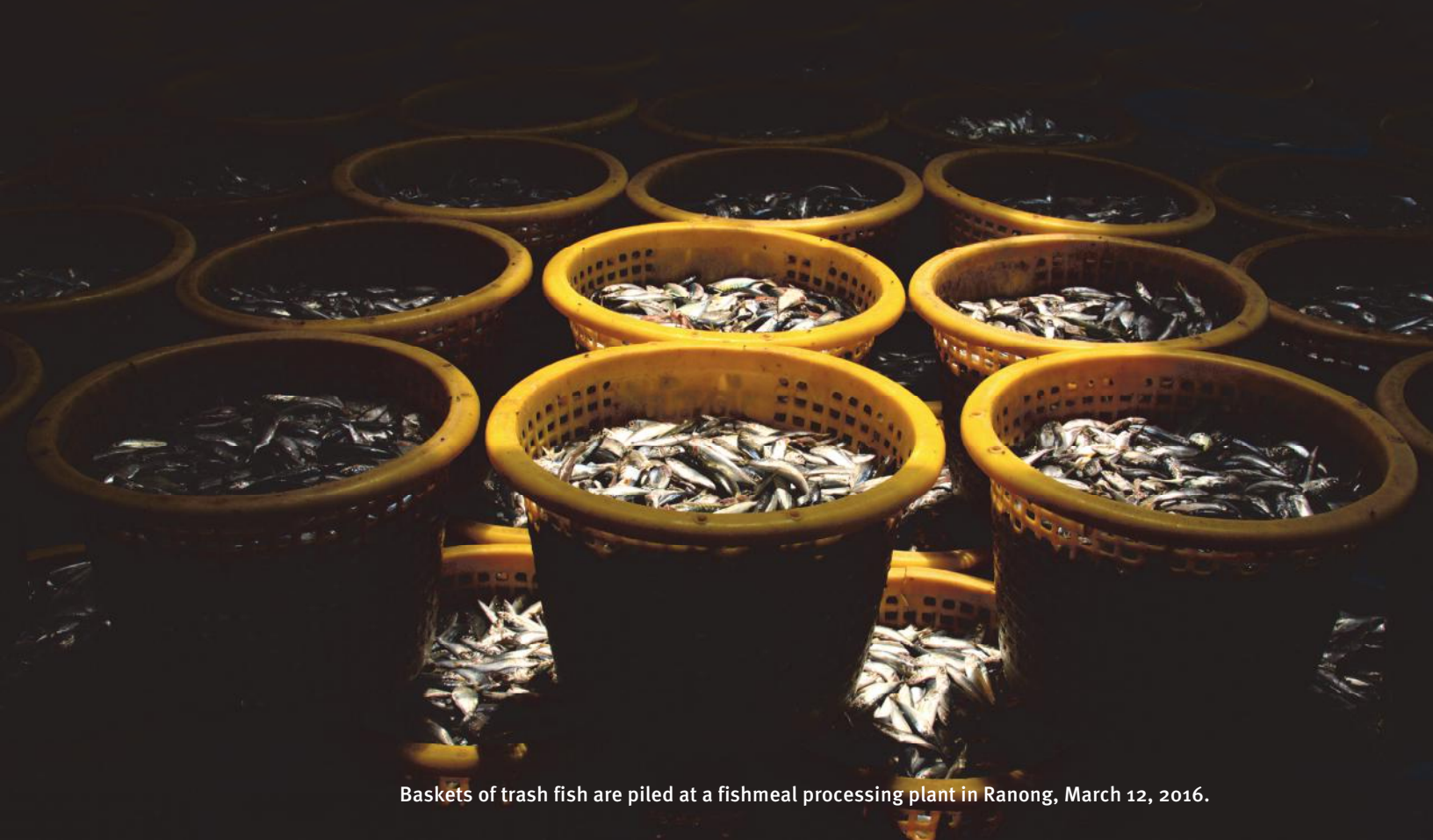
Baskets of trash fish are piled at a fishmeal processing plant in Ranong, March 12, 2016.

government agencies such as the Department of Labour Protection and Welfare and the Department of Employment, which both operate under the Ministry of Labour.