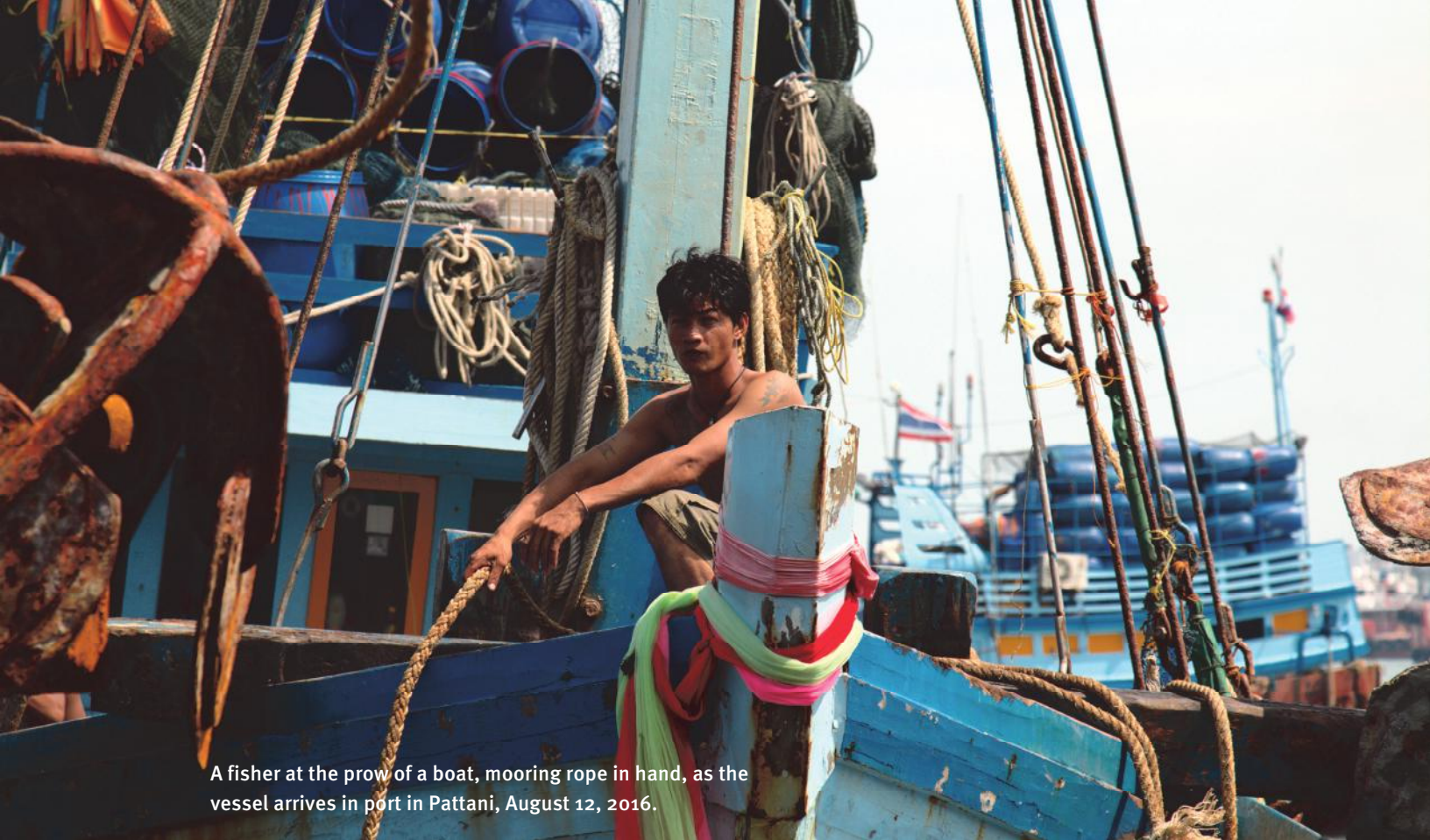
A fisher at the prow of a boat, mooring rope in hand, as the vessel arrives in port in Pattani, August 12, 2016.

sale in the freezers of the world’s top four retailers. 5 Ten days later, the United States Department of State downgraded Thailand in its annual Trafficking in Persons (TIP) report to Tier 3, the lowest possible status. Prompted in part by numerous media exposés that raised serious concerns about killings, beatings, and trafficking of migrant fishers, many from Burma and Cambodia, the European Commission in April 2015 issued a “yellow card” warning to Thailand, identifying it as a possible non-cooperating country in fighting illegal, unreported, and unregulated (IUU) fishing. A subsequent “red card” would lead to European Union sanctions.