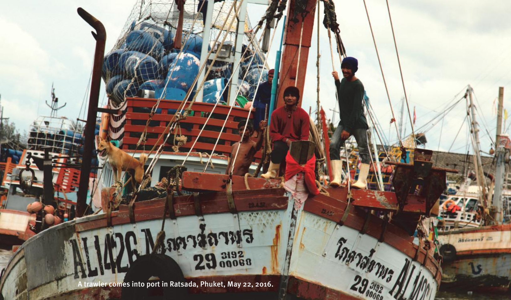
A trawler comes into port in Ratsada, Phuket, May 22, 2016.