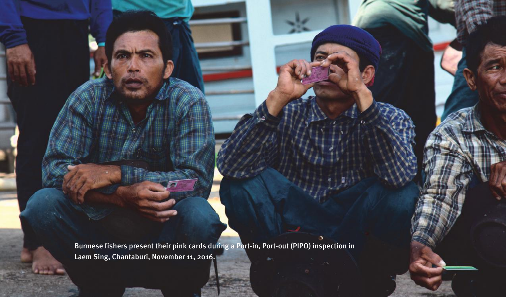
Burmese fishers present their pink cards during a Port-in, Port-out (PIPO) inspection in Laem Sing, Chantaburi, November 11, 2016.

Human Rights Watch research identified 20 forced labor situations in 34 group and individual interviews with fishers, accounting for 90 of the 138 fishers we interviewed who were still employed on boats at the time of the interviews. 6