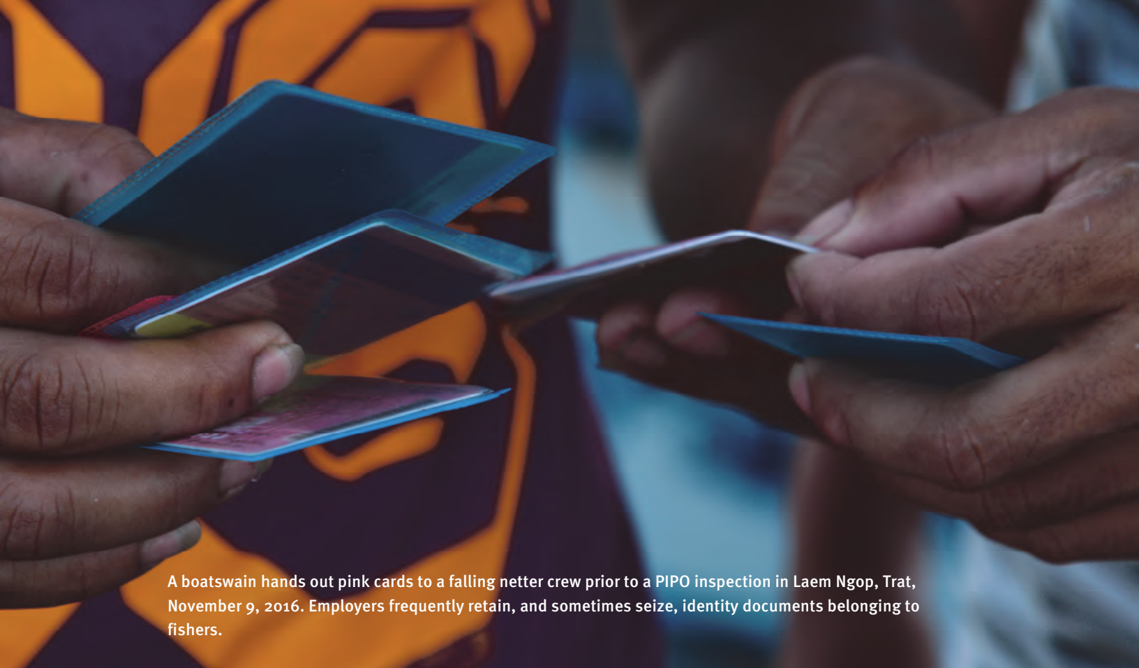
A boatswain hands out pink cards to a falling netter crew prior to a PIPO inspection in Laem Ngop, Trat, November 9, 2016. Employers frequently retain, and sometimes seize, identity documents belonging to fishers.

monitoring and control of workers, ensuring only that the fisher is matched to his pink card and his name appears on the crew manifest for the boat he is on.