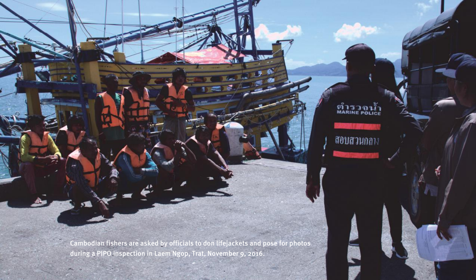
Cambodian fishers are asked by officials to don lifejackets and pose for photos during a PIPO inspection in Laem Ngop, Trat, November 9, 2016.

secured their jobs through similar channels but who are not victims of forced labor, or alongside individuals who can be considered trafficking victims as a result of the way they were recruited.