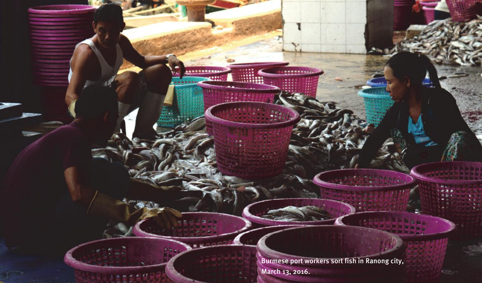
Burmese port workers sort fish in Ranong city, March 13, 2016.

These reforms have focused primarily on establishing control over fishing operations and tackling IUU fishing. Yet they have had little effect on human rights abuses that workers face at the hands of ship owners, senior crew, brokers, and police officers. Meanwhile, the impact of stronger regulatory controls on improving conditions of work at sea has been limited as a result of poor implementation and enforcement.