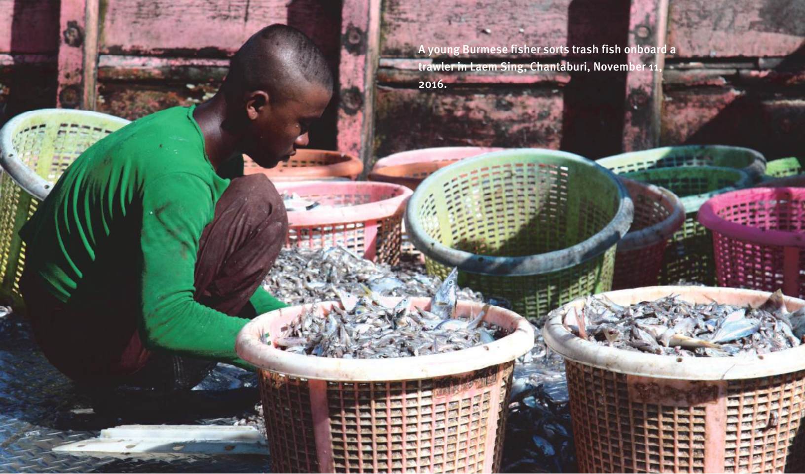
A young Burmese fisher sorts trash fish onboard a trawler in Laem Sing, Chantaburi, November 11, 2016.

Many of the human rights problems in Thailand's fishing industry are common to migrant workers in sectors throughout Thailand's economy, whose exploitation is aggravated, and sometimes caused, by the government's haphazard national policies on labor migration.