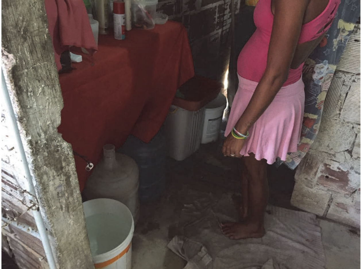
A 25-year-old pregnant woman stands near uncovered water storage containers in her home in a run-down neighborhood in Recife, Pernambuco state. She showed Human Rights Watch how sewage flowed directly into the streets in her neighborhood and how dirty, standing water accumulated in areas near her home. “People don’t care how we’re living here,” she said. She said she could not afford to purchase mosquito repellent to protect herself from the Zika virus during her pregnancy.

between 10 and 30 reais per day—the only income she had to support herself and her 2-year-old son. She lived in a run-down neighborhood with open sewage and standing water, but she was unable to wear repellent. “I don’t use it because I can’t afford it,” she said, explaining that she used a fan to try to keep mosquitos out of the house. 246