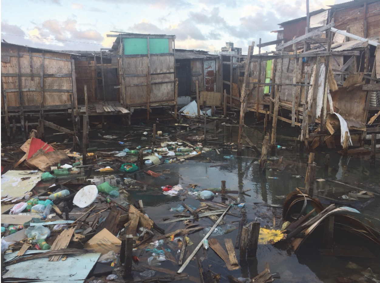
Wastewater and garbage are dumped directly into the river in a slum in the Coelhos neighborhood of Recife, Pernambuco state.

larval development and adult resting sites for mosquitos that can carry Zika and other viruses, and yet these are often not the focus of eradication efforts. 144