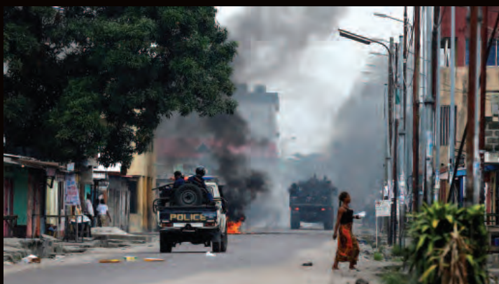
Congolese police drive past a fire barricade during demonstrations in Kinshasa, the capital of the Democratic Republic of Congo, December 20, 2016.

Human Rights Watch calls on President Kabila and other senior officials to end all unlawful and excessive use of force and other forms of repression against protesters, activists, and the political opposition, and to cease all recruitment of M23 fighters to participate in such repression. Congo’s international partners should increase the pressure on Kabila to step down as required by the constitution and support a peaceful transition and credible elections.