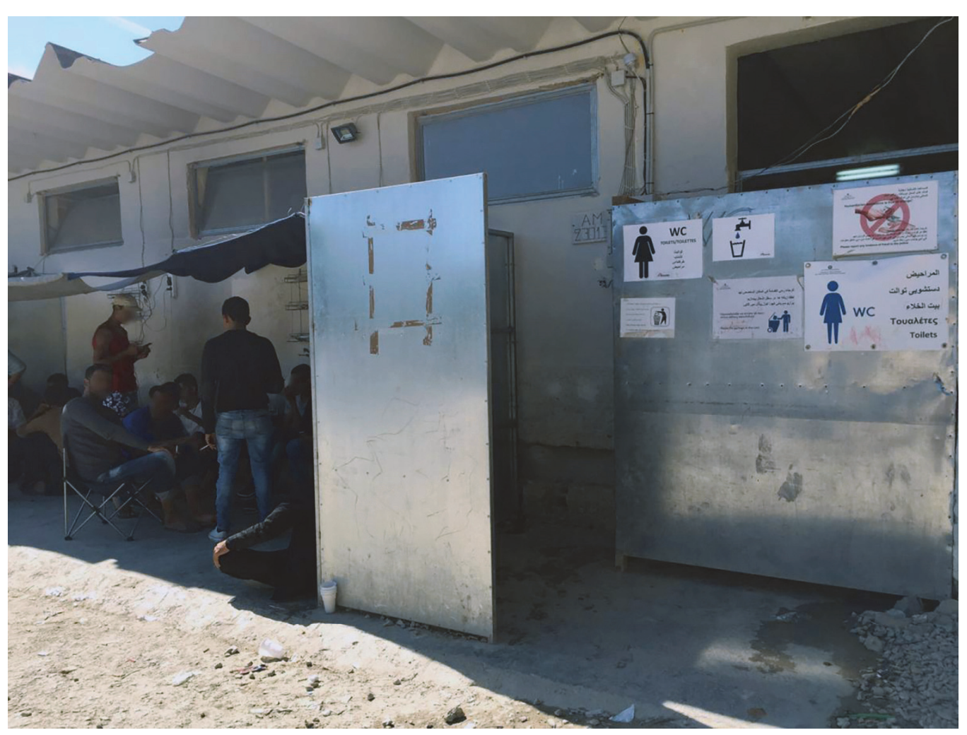
Men are regularly present near the women's latrine at the Moria refugee camp, on Lesbos Island, Greece. Women described routine sexual harassment, particularly when going to and from or using the camp's bathrooms.

One Haitian woman recounted the fear she and other women experienced when trying to reach portable camp toilets in a distant, insecure area. "We are scared," she said. "We have no security." Pecause of that, she sometimes avoided the camp toilets and instead defecated and changed menstrual materials in the open. As a result, she said that she chose the safety of staying near her tent over using the minimal sanitary facilities in the camps, even if that could contribute to vaginal infections.