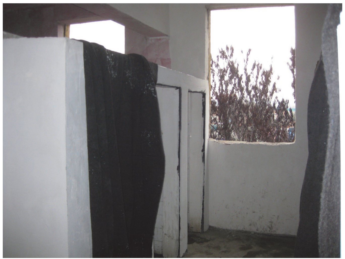
A bathroom in one of the residential buildings in the Harmanli migration center, Bulgaria. The toilets had no doors and the windows had no glass. Temperatures were below freezing.

shocked me with it twice. First, when I was urinating and then to make me move faster.<sup>116</sup>