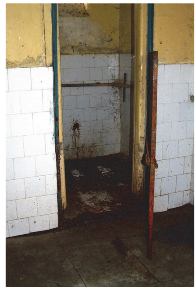
A toilet in Pune Mental Hospital, India. With only 25 working toilets for 1,850 patients, open defecation was the norm when Human Rights Watch visited in 2013 prior to renovations to its sanitation system.

Residential facilities for persons with disabilities and health facilities often lack adequate sanitation facilities. Abusive practices in these institutions may make using or accessing the bathroom difficult. In psychiatric wards in Ghana in 2011, for example, Human Rights Watch researchers saw toilets filled with feces and cockroaches. From the gates of these wards, there was a powerful stench of urine and feces.<sup>131</sup> A 21-year-old man chained to a wall in one of these facilities told Human Rights Watch, "We shit here and they don't come to clean up. ... It smells a lot inside here."132 In another facility Human Rights Watch visited in Ghana, most persons with psychosocial disabilities were chained to trees, and they had to urinate in the open and defecate into small plastic bags which were later thrown into surrounding vegetation. 133 In so-called prayer camps visited by Human Rights Watch that also housed persons with psychosocial disabilities in