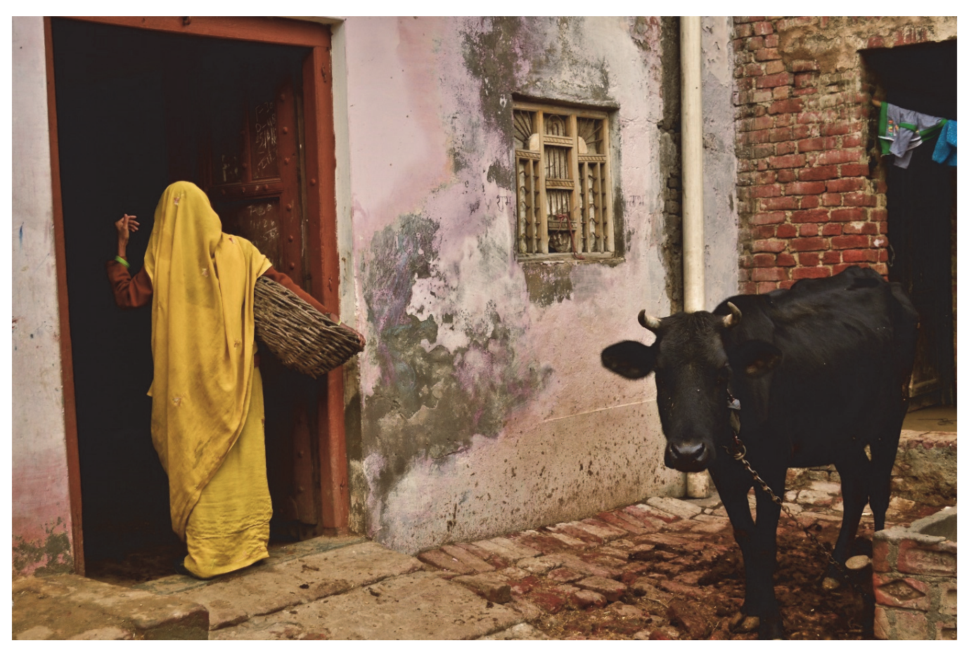
A Dalit woman enters a home in Uttar Pradesh, India, through a back entrance to remove excrement from dry toilets.

health consequences. Those who do the work, however, also typically face "untouchability" practices. Discrimination that extends to all facets of their lives, including access to education for their children, makes it more likely they will have no choice but to continue to work as manual scavengers. Sona, from Bharatpur city in Rajasthan, India, described to Human Rights Watch in 2014 her first day of work and why she had no choice but to continue: