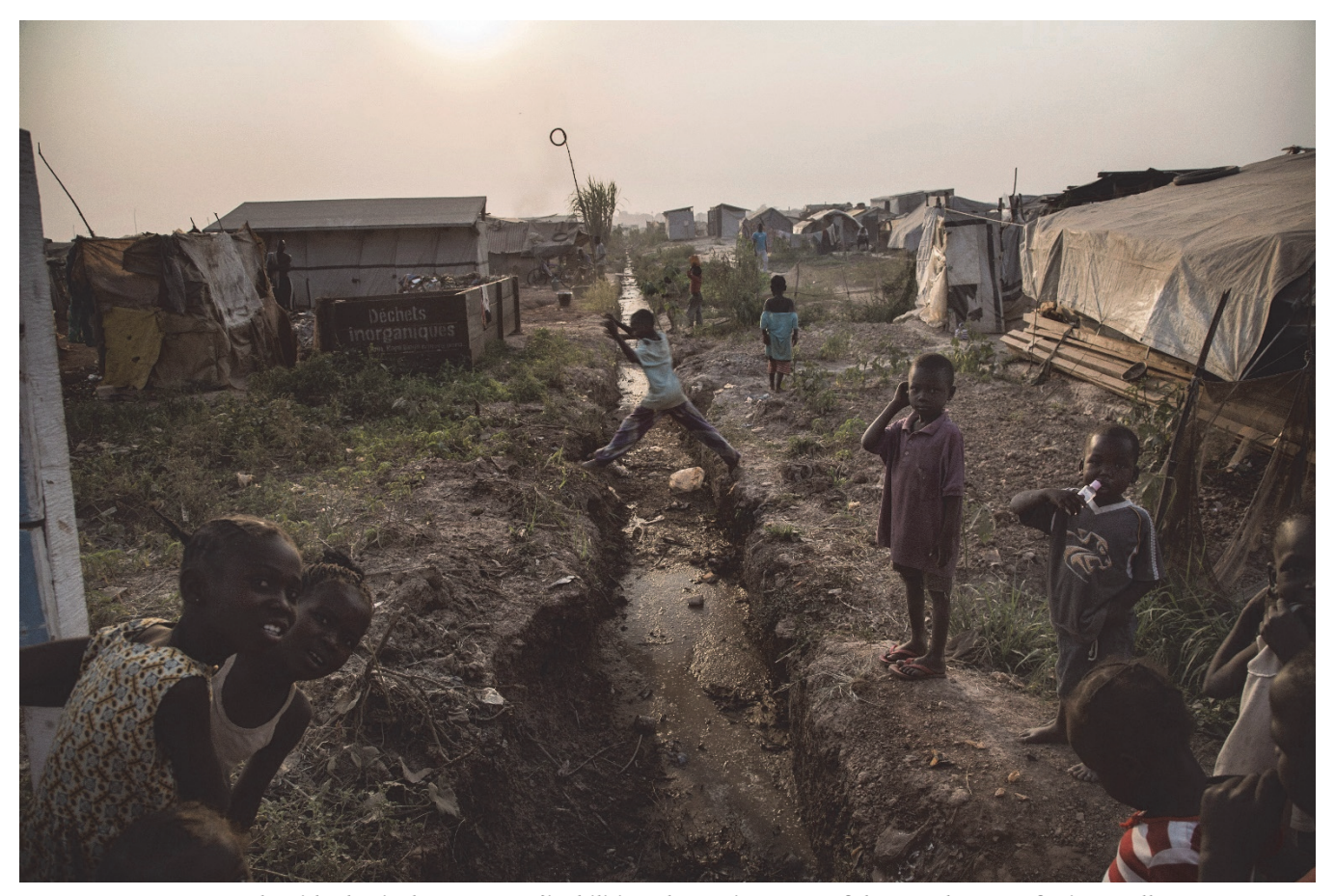
For many people with physical or sensory disabilities, the environment of the M'Poko camp for internally displaced people in Bangui, Central African Republic, is hard to navigate. The uneven terrain is speckled with holes and open drains.