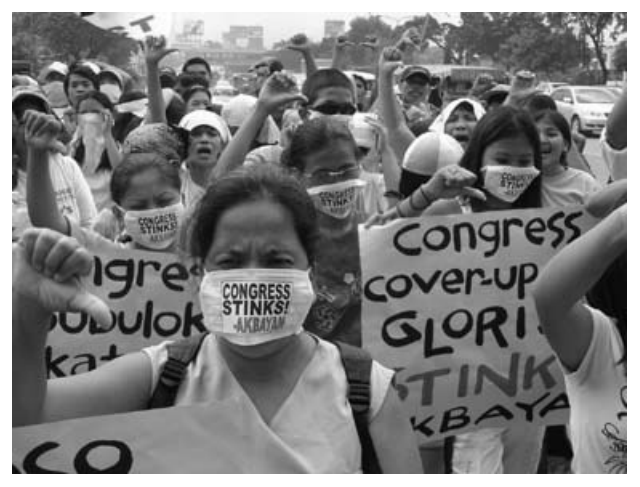
Demonstration demanding Gloria Arroyo resignation