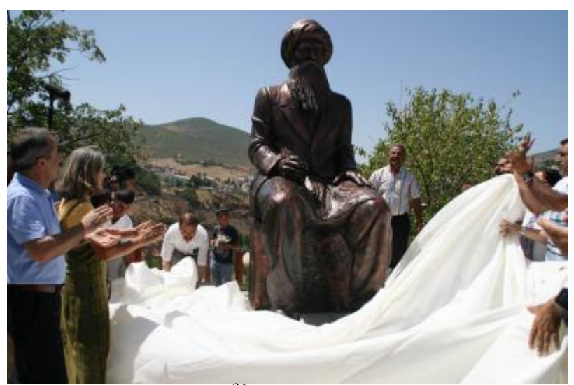
Unveiling of Seyid Riza statue 36

Council in the summer of 2010.<sup>34</sup> A second source, dated 29 July 2010, reported on the opening of the Seyid Riza statue, suggesting that the unveiling took place in late July 2010.<sup>35</sup>