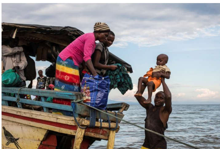
Burundian refugees arrive at Mboko, DRC, by boat.