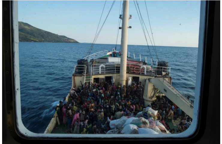
Burundian refugees on the front deck of the MV Liemba being transferred from Kagunga to Kigoma, from where they will be transported to Nyarugusu refugee camp.