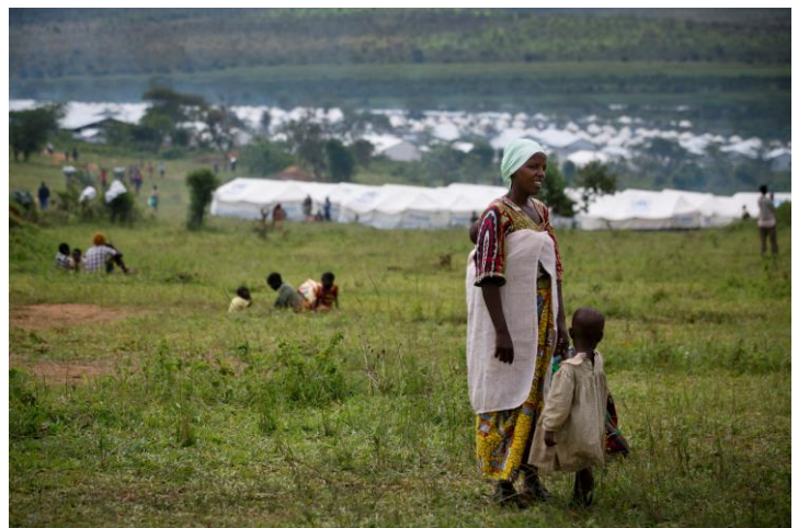
A Burundian woman and her children in Mahama refugee camp.