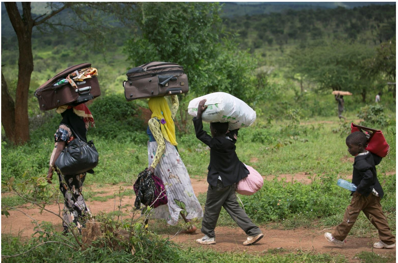
A Burundian family head towards their tent with their belongings in Mahama refugee camp, Rwanda.