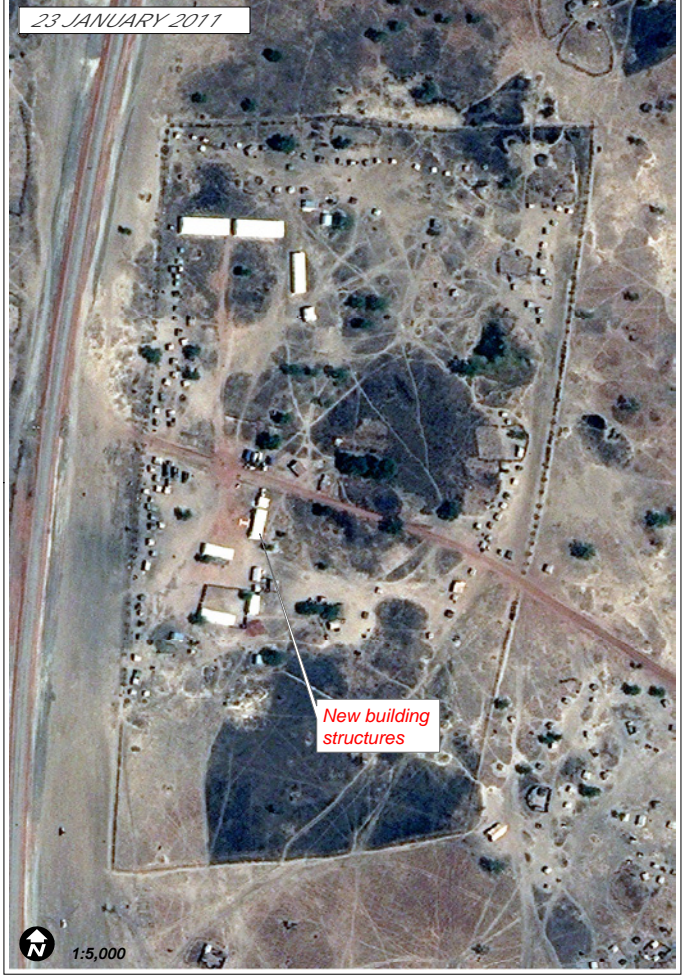
Detail of new development and buildings on 23 January 2011

Satellite Imagery (left): IKONOS Resolution: 1.0m Imagery Date: 22 June 2008 Report Analysis: UNITAR / UNOSAT