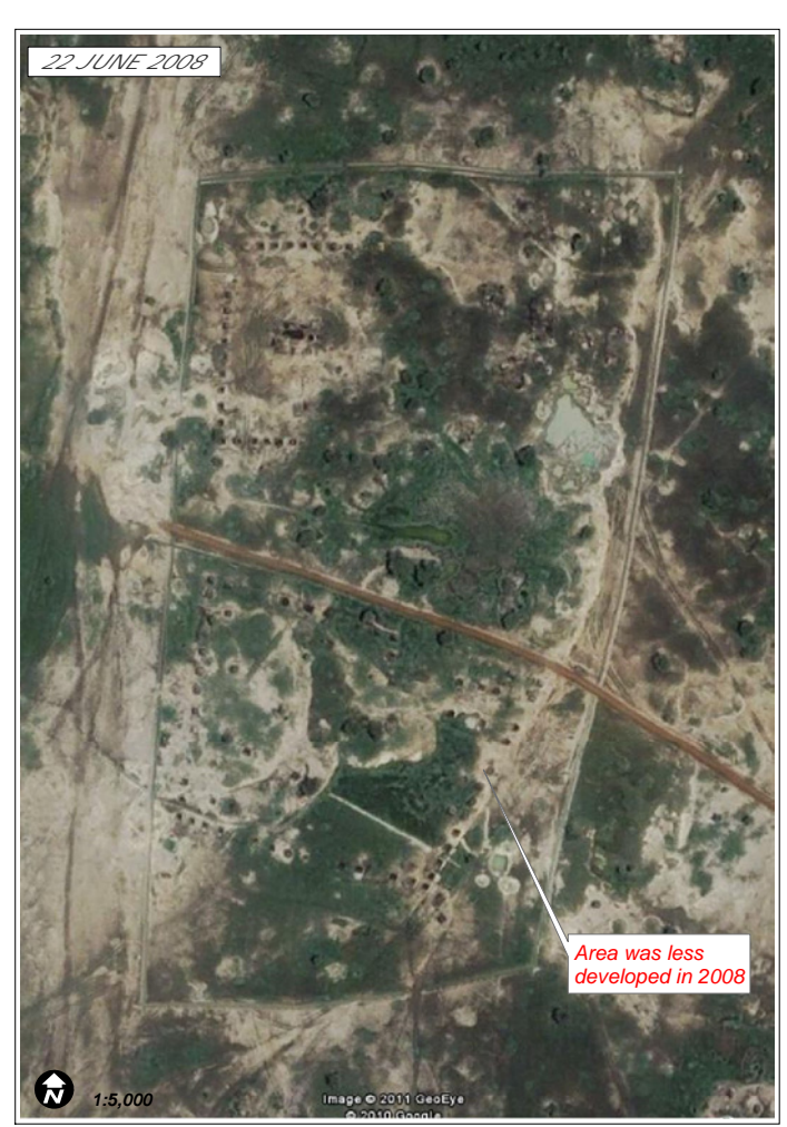
Detail of build-up area in Abyei on 22 June 2008

ANALYSIS SUMARY: This analysis shows the town of Abyei in South Sudan. The analyzed very high resolution satellite imagery was acquired on the 23<sup>rd</sup> of January 2011 and compared against two earlier images; from the 19th of December 2010 and the 22nd of June 2008. Returnee areas and infrastructure development can be identified and are marked with annotations. New buildings and road works are the main changes.