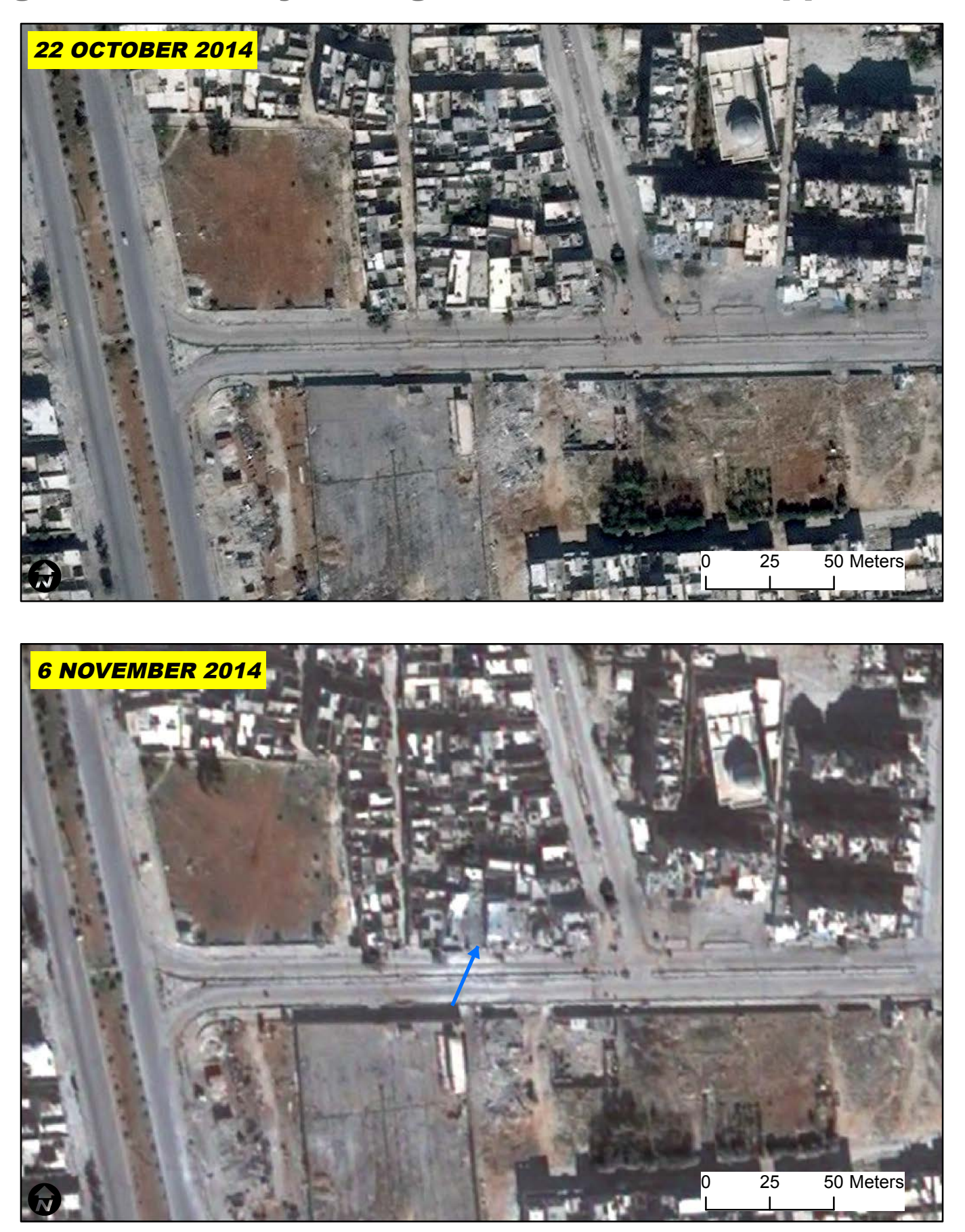
The figure shows a portion of Hanano neighborhood, Aleppo where a few buildings appear severely damaged (blue arrow). This damage can be caused by artillery and direct fire from tanks and other armored vehicles.