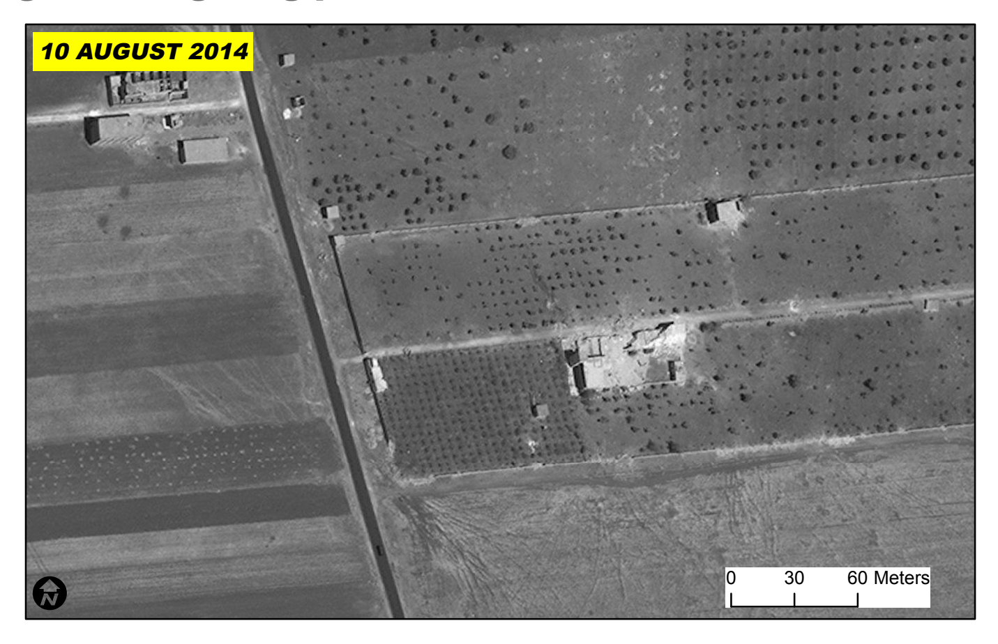
Figure 4: Fighting positions and access constraints