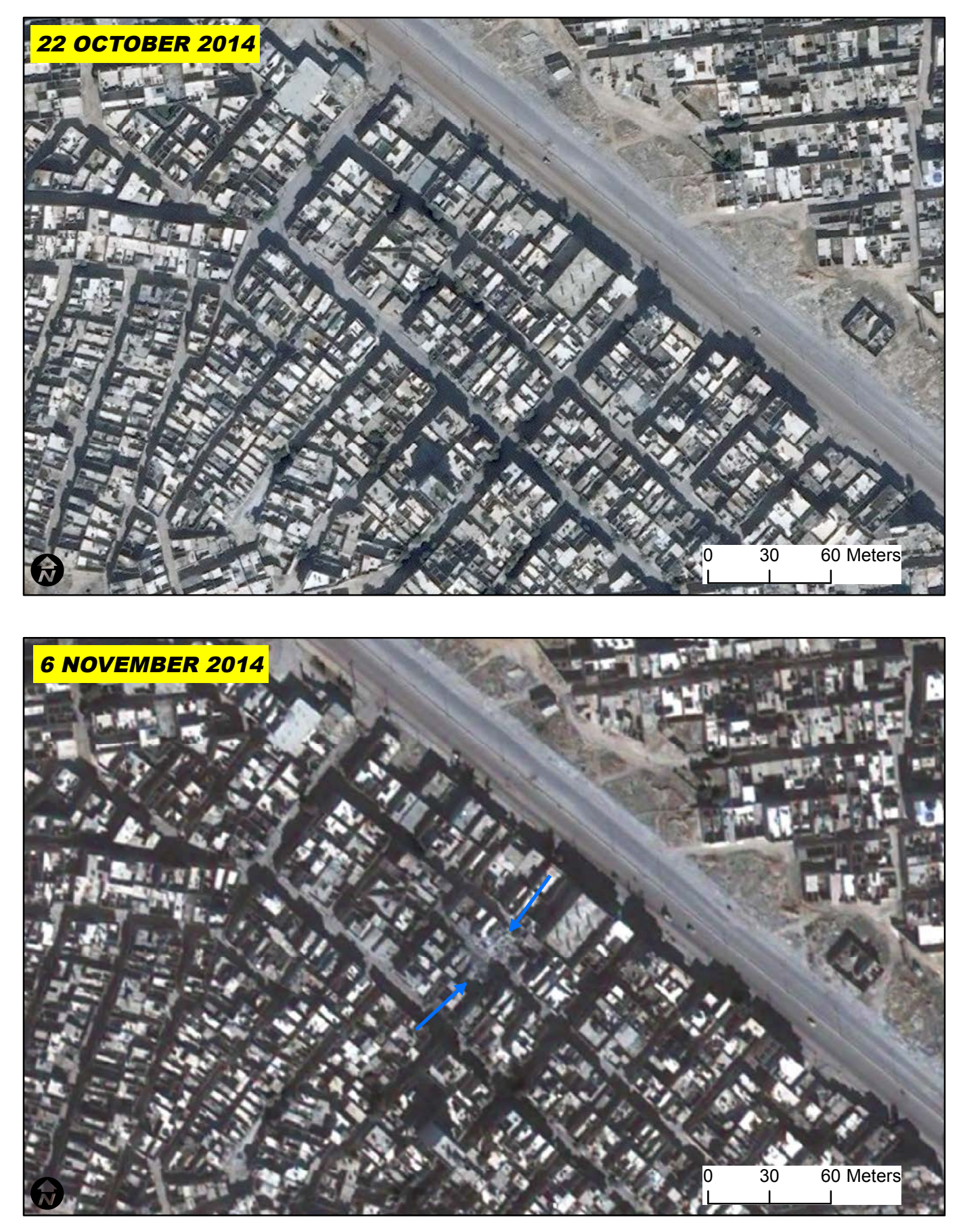
The figure shows a portion of Ba'aiedin neighborhood, Aleppo where several buildings appear destroyed or severely damaged (blue arrows). This damage is similar to that observed from air strikes or barrel bombing.