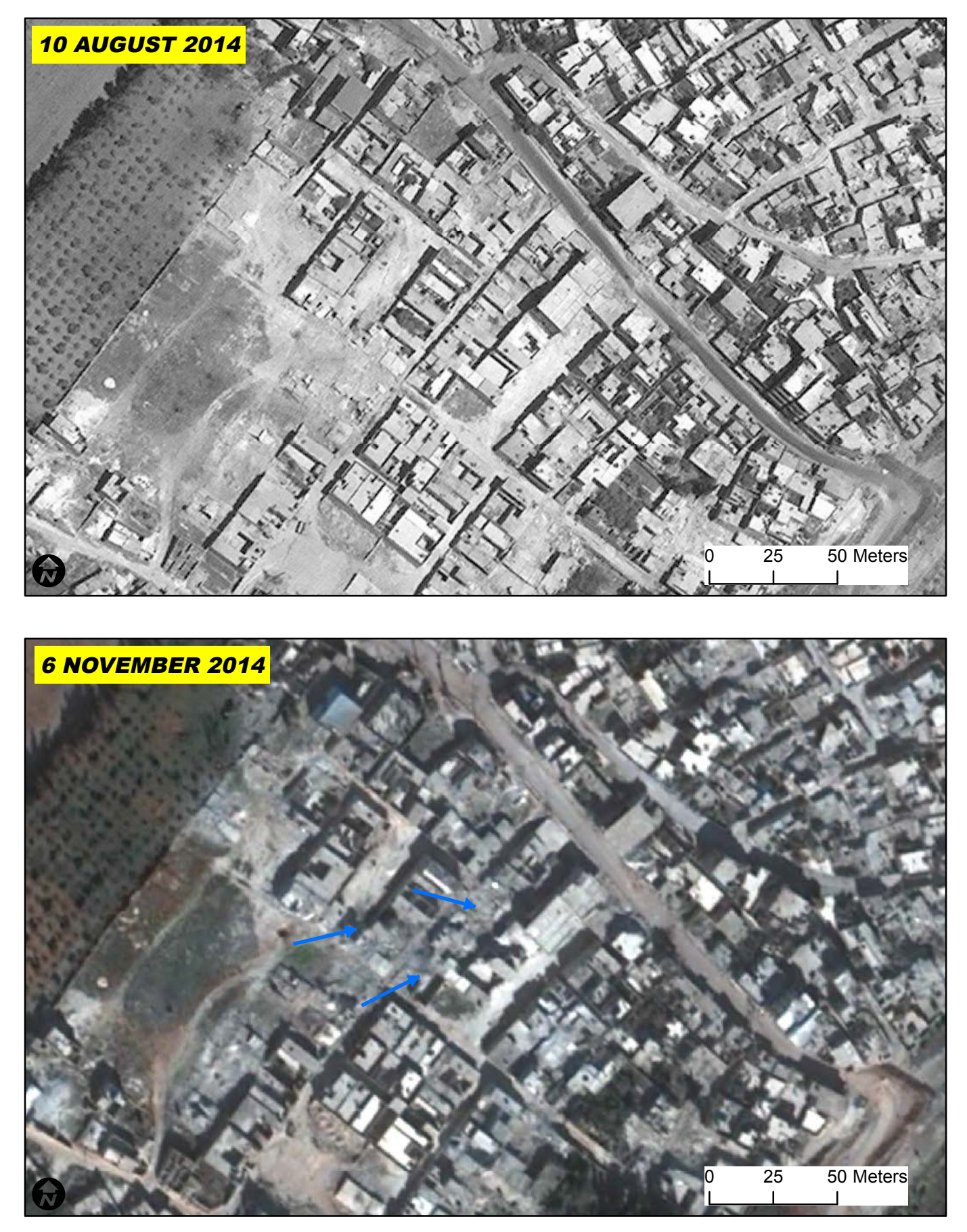
The figure shows a portion of Handarat District, north of Aleppo. Imagery shows several destroyed or severely damaged buildings in the area (blue arrows). Numerous impact craters on the fields surrounding the area are also visible.