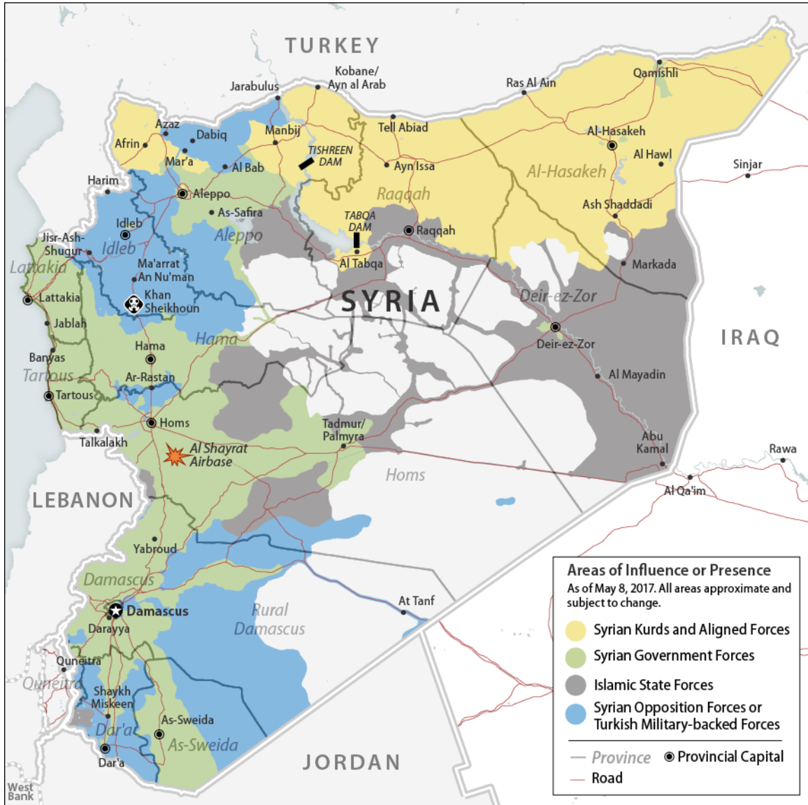
Figure I. Syria: Areas of Influence

Source: CRS using area of influence data from IHS Conflict Monitor, last revised May 8, 2017. All areas of influence approximate and subject to change. Other sources include U.N. OCHA, Esri, and social media reports.