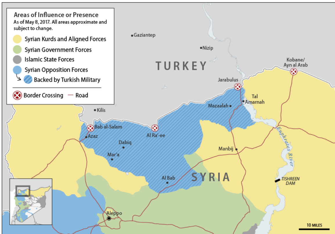
Figure 3. Syria-Turkey Border As of May 8, 2017