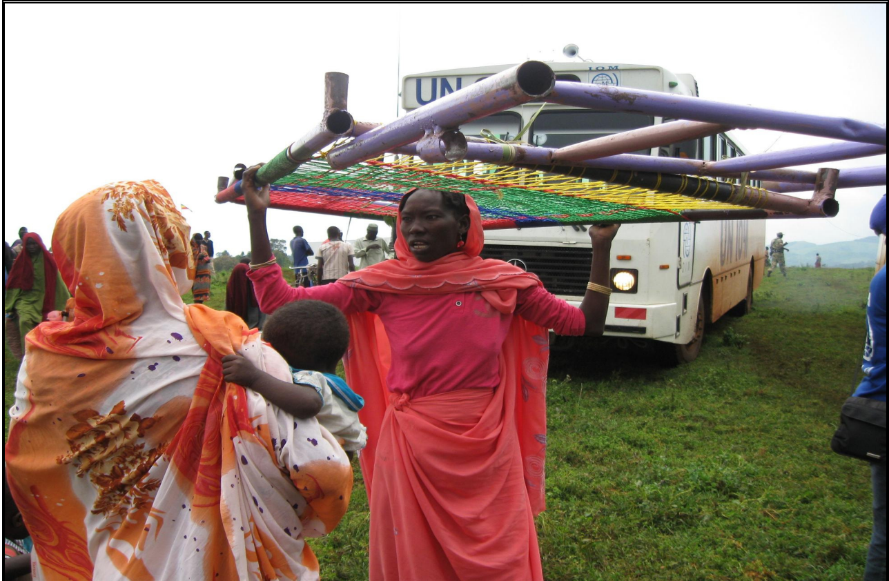
Just arrived in Tongo, a woman carrying a bed frame on her head from the truck that transported their goods.