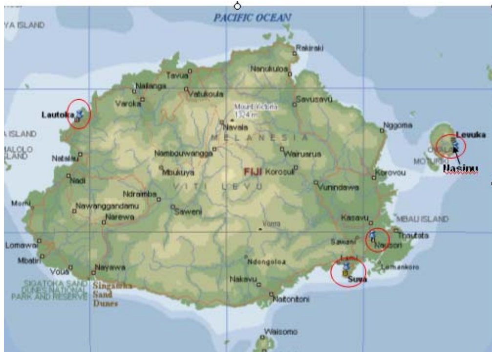
(‘Viti Levu: Fiji’ 2000, Microsoft Encarta Interactive Atlas 2000 – Attachment 10).