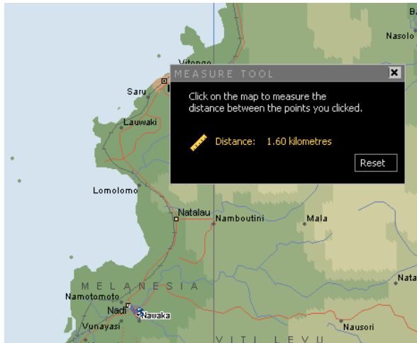
(‘Distance from Nadi to Nawaka’ 2000, Microsoft Encarta Interactive Atlas 2000 – Attachment 1).

Please see Attachment 2 for Lonely Planet maps showing the location of Nawaka. Maps have been included of Viti Levu Island, “Nadi, Lautoka & Around” and Fiji (Miller, K., Jones, R. & Pinheiro, L. 2003, Lonely Planet: Fiji (6th ed.), Lonely Planet Publications, Melbourne, pp. 102 – 105 – Attachment 2).