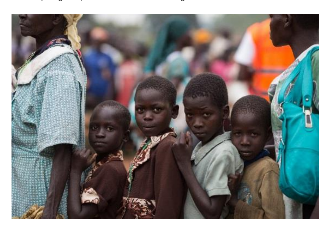
Children's Emergency: A significant majority of new arrivals are under the age of eighteen.