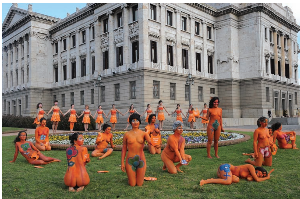
Women's rights activists protest in front of Parliament to demand the decriminalization of abortion, Montevideo, Uruguay, 25 September 2012.

The World Health Organization states that in the field of sexual and reproductive health, conscientious objection acts as a barrier to certain health services to which women have a right. 130 It emphasizes that in cases of access to abortion it is a unique barrier because it pits the right of a woman to life and health against that of the medical professional to act according to their conscience. This is because conscientious objection in health services seeks to challenge or change a rule or a public policy and has implications for the provision of health services and the protection of the rights of third parties. 131 In addition, conscientious objection in the fields of reproductive health tends to have discriminatory effects, because it affects almost exclusively or disproportionately women and girls of reproductive age.