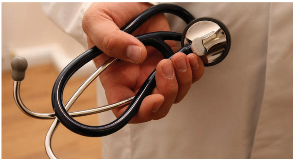
Doctor holding a stethoscope, 2012.