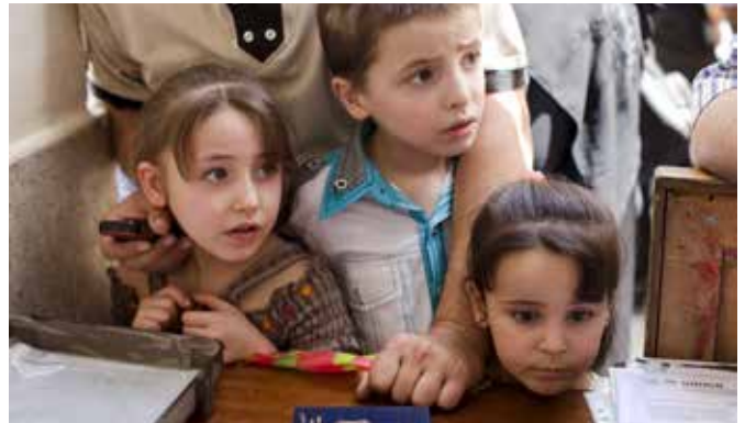
In Syria, and in exile abroad, civil status documentation serves as the foundation for enjoying an array of fundamental rights.

With Syrians identifying civil society support as an important resource in coping with protection challenges, UNHCR supports community-based interventions that include a network of 52 community-centers and 1,200 community outreach volunteers. By the end of 2016, UNHCR aims to increase this network to 80 community centres and 2,000 community outreach volunteers, and outreach capacity will be further complemented by adding mobile units to 18 community centres to reach remote areas.