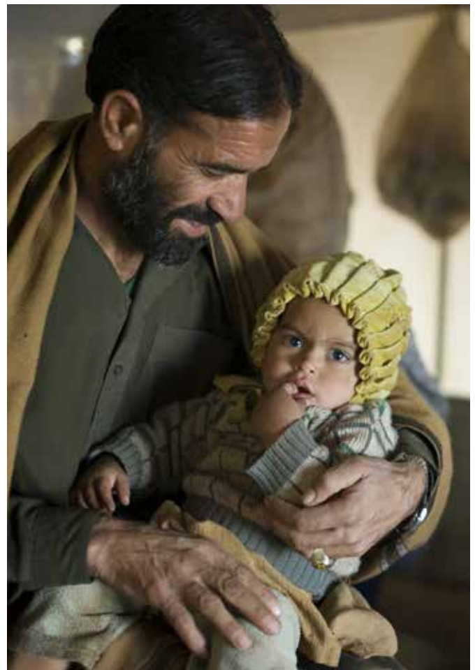
A birth certificate gives a child proof of its parentage, and thus its nationality.

concerns raised by these gaps. UNHCR has focused on how various sectors of the refugee response as well as the response to displacement inside Syria can minimize these risks of statelessness, while also improving the protection, security and dignity of those displaced.