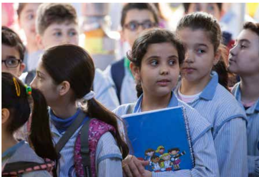
Stateless children can face challenges in enjoying their rights to education, including the ability to attend class, sit for exams or obtain certificates of graduation.

Adults displaced by conflict and whose documentation is lost, destroyed or confiscated may also face a certain risk of statelessness if it becomes impossible to replace their documents due to the destruction of original civil registries in certain locations, which has been reported in Syria. The absence of this documentation also impacts on the registration of subsequent divorces, deaths, marriages, and births—all of which can, in turn, also affect a Syrian child's acquisition of nationality. 4 The conflict in Syria has also led to forced displacement and protection risks among groups that were already stateless in Syria, including certain Kurdish populations.