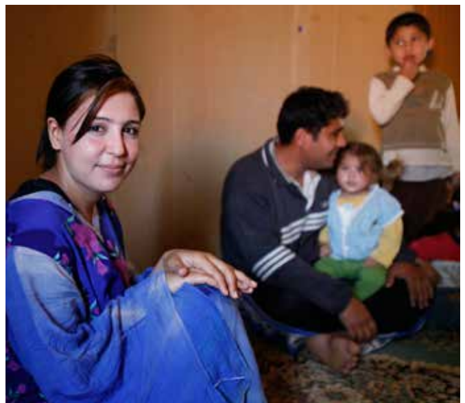
Marriage and birth certificates enhance the protection of women and children by securing their rights to family unity.

Syrian nationals in Turkey registered by the government as Temporary Protection beneficiaries enjoy free access to all forms of maternal health services, including prenatal, delivery and post-natal care, as well as prescription medication. With the issue of transportation identified as a challenge for some refugees, the government has instituted transportation assistance to bring pregnant who reside in camps to hospitals to ensure safe deliveries and the issuance of medical birth notifications.