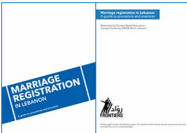
Manual on Marriage Registration in Lebanon by Frontiers Ruwad, developed with support from UNHCR

In Iraq, UNHCR launched an intensive awareness-raising and community engagement campaign on birth registration, featuring the distribution of print and video materials throughout the KR-I. The UNHCR Office in