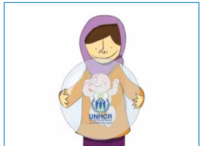
UNHCR’s video on birth registration explains the steps and the importance of the procedure in the KR-I: www.youtube.com/watch?v=ZvtSIAMXx9U

Capacity-building activities have targeted local authorities in all governorates and districts, bringing a measured improvement in the accessibility of birth registration procedures at the local level. Partners have also mapped gaps in access to birth registration nationally and within various localities to conduct more targeted advocacy and to develop localized coordinated action plans involving humanitarian agencies and community-based organisations.