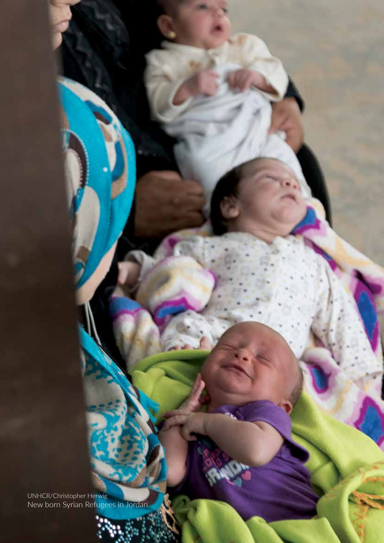
New born Syrian Refugees in Jordan