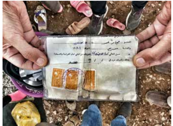
A Kurdish maktoum refugee shows his “shahadat tararif” in the Kurdistan Region of Iraq (KR-I), an informal document issued to certain stateless individuals in Syria.

legislative reform prepared by civil society groups in their respective countries. In June 2016, the UN Human Rights Council convened a special event on Realizing Women's Nationality Rights which was co-sponsored by 15 UN Member States including Algeria and Turkey. The event, supported by the Global Campaign for Equal Nationality Rights, drew attention to the important reforms undertaken in MENA, while stressing the urgent need for similar amendments in other States, particularly those affected by conflict and displacement.