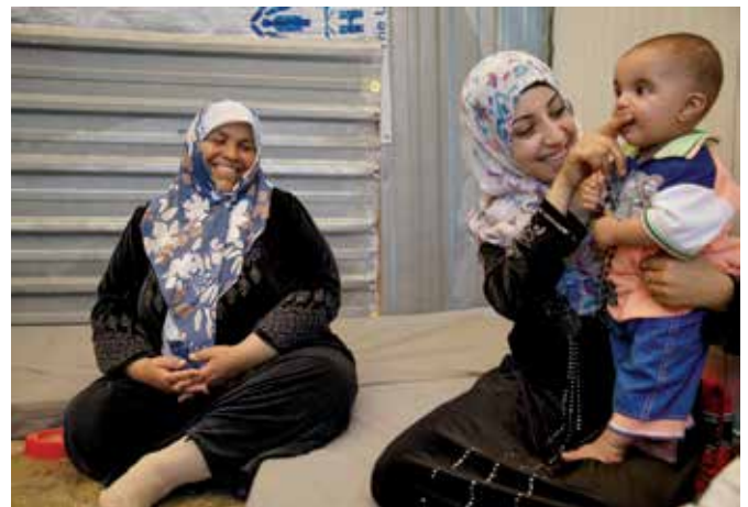
A Syrian refugee child in Jordan has just received his birth certificate.

Jordan's courts have instituted evidentiary rules to ease the process of ratifying undocumented marriages on the basis of witness statements, and the documentary requirements for registering new births have also been eased. Under Jordan's Personal Status Law, only original identity documents or notarized copies are accepted to register new births. Noting that many refugees no longer possess their original identity documents, the government has established a policy of accepting photocopies of prerequisite documents, vastly increasing access to birth registration in the process. These measures have brought a 12 fold increase in the number of refugee children born in camps received birth certificates in 2015, (3,645 total) in comparison to 2013 (295 total).