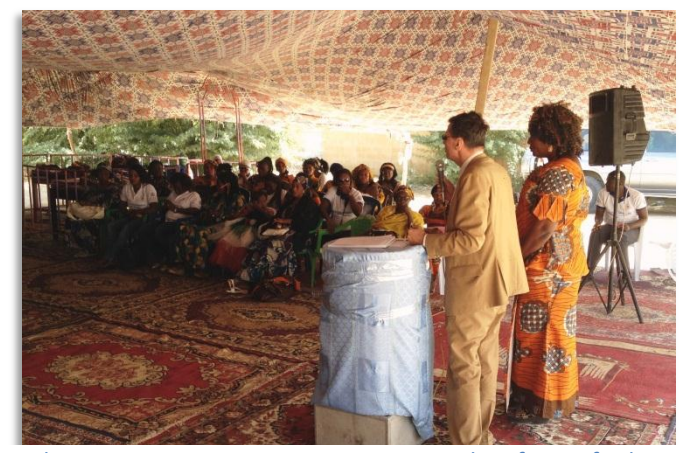
The UNHCR Representative gave a speech in front of urban refugee women in Nouakchott during International Women's Day