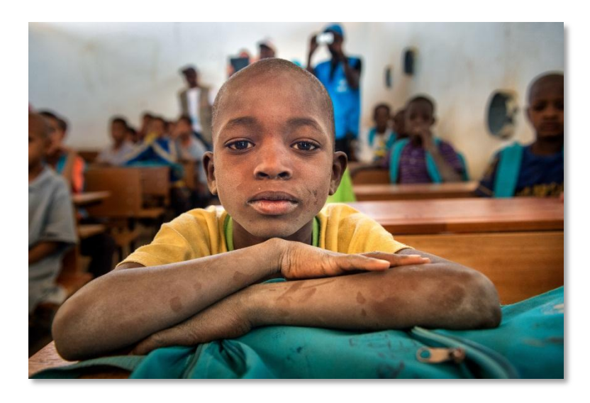
Child at school in Mberra camp UNHCR/A.Dragaj/March 2015

Violent clashes in northern Mali in early 2012 triggered important waves of displacements into Mauritania, where a refugee camp was established 50 Km from the Malian border in the Hodh el Charghi region. Following the military intervention in northern Mali in January 2013, new influxes of Malian refugees occurred, thus further stretching the limited resources available in the area.