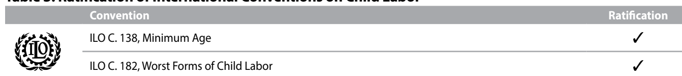
Table 3. Ratification of International Conventions on Child Labor

Thailand has ratified all key international conventions concerning child labor (Table 3).