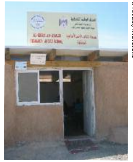
top: Children in al-Khan al-Ahmar school in the Jahalin Bedouin encampment, April 2010. above: The outside of the school.

school told Amnesty International that the school was "a hundred times, a thousand times better" than the distant school in lqbet Jaber, and feared that they would be unable to continue with their education if it were destroyed.