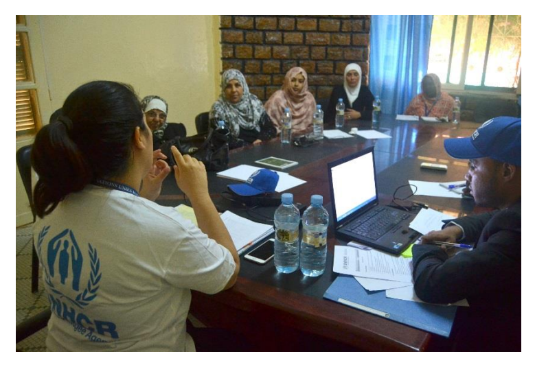
UNHCR staff meet with Syrian refugee women during a focus group discussion in Nouakchott.

participate fully in the decisions that affect their lives and the lives of their family members and communities. This year, themes such as "refugee documentation", "self-reliance", "access to health" and "education" were discussed with the refugees to assess and better respond to their needs. On this occasion, several focus groups were established for discussion so that each community could be represented. More than 290 between urban refugees