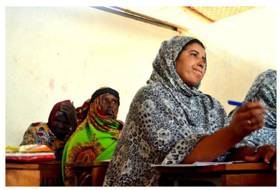
Adults attend literacy classes in their own language in Mbera refugee camp.