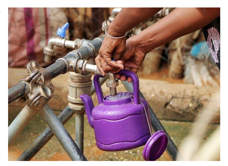
Water quality in Mbera camp is assured through regular tests to prevent the spread of waterborn dieases.

up campaigns to raise awareness on water and sanitation and prevent the spread of waterborne diseases.