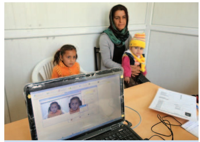
A Turkish refugee woman and her children take part in the new registration in Makhmour camp. The camp hosts 10,240 Turkish refugees. Most arrived in Iraq in 1994 following armed conflict in southeast Turkey. The Government of Iraq, assisted by UNHCR, started a new registration of all refugees in the camp on 31 October 2010, which was completed on 19 June 2011.