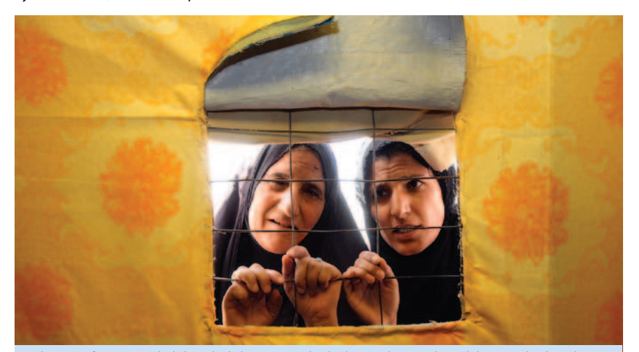
Palestinian refugee women look through a hole in a tent in Al Waleed camp. The camp, located along Iraq's border with Syria, now hosts 540 Palestinians. UNHCR relocated some 1,200 Palestinian refugees from Al Waleed camp to various resettlement countries. Of the estimated 34,000 Palestinians in Iraq in 2003, less than 10,000 remain in the country at present. The camp also hosts 173 Iranian Kurds and 101 Iranian Ahwazis.

orld Refugee Day was celebrated on 20 June to pay tribute to the millions of refugees and displaced people throughout the world who have been forced to flee their homes because of