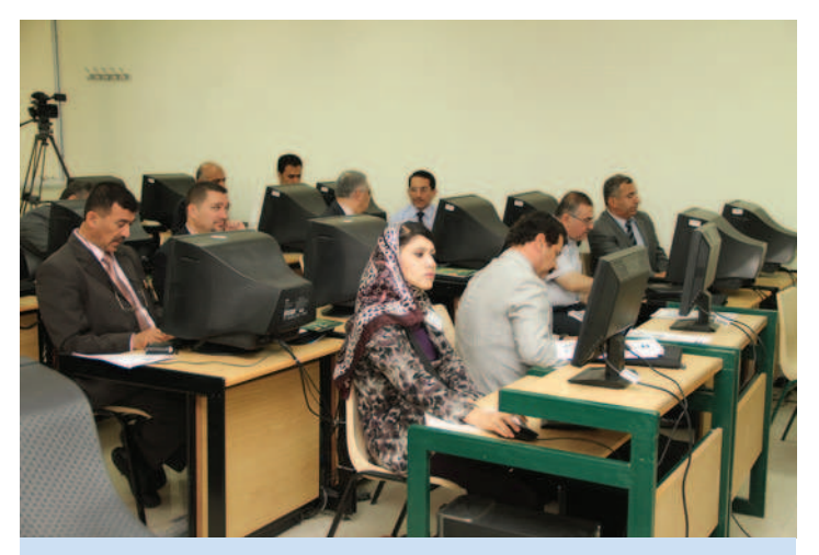
Participants in the Avicenna Virtual Campus Technical workshop, held in Philadelphia University in Jordan on 21-22 June 2011.

Hosted by Philadelphia University, a leading UNESCO e-learning Center in the Middle East, the meeting focused on enhancing the quality of education through the improvement of online course production and virtual teaching processes while building consolidated partnerships among Iraqi and international universities.