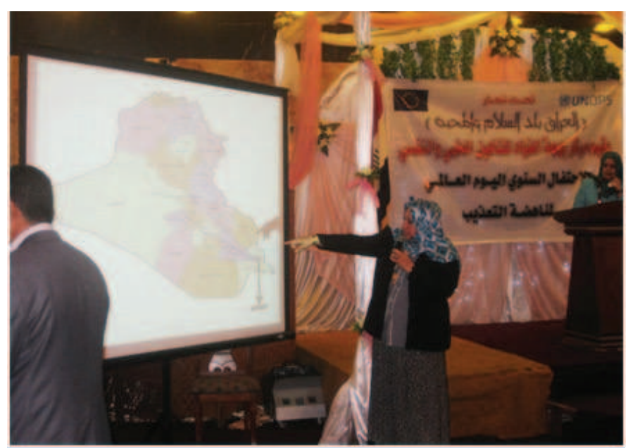
A staff member presents the work of the outreach team which provides services to victims of torture in nearby provinces.