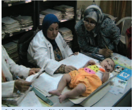
Staff at the Ministry of Health monitor the growth of an Iraqi child in Baghdad.

Ten-year national nutrition strategy revamp at hand