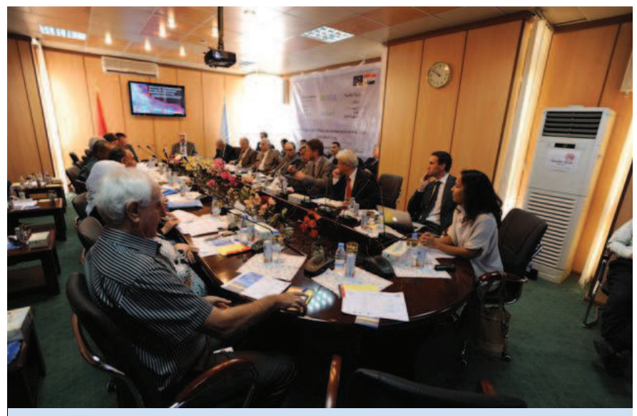
Representatives of the Government, academia and the international community at the launch of Iraq's first groundwater database on 3 July 2011.