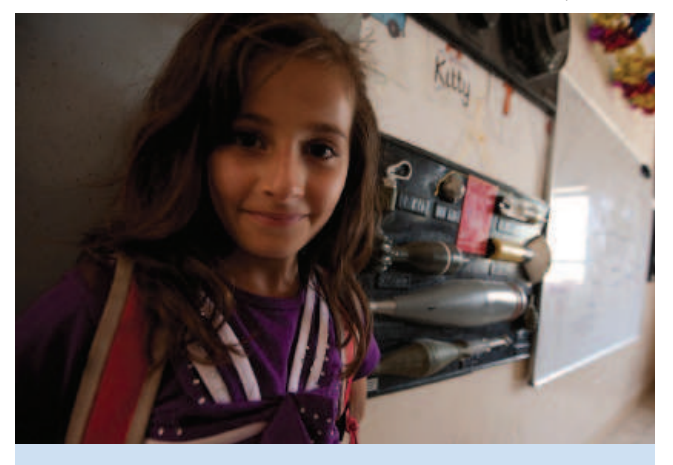
Ashawa, Dohuk Governorate, Kurdistan region of Iraq -- A student from Ashawa Pri¬mary School, one of the beneficiaries of the UNICEF-supported Mine Risk Education Summer programme in Ashawa village. The iniative is implemented by the General Directorate of Mine Action and the Iraqi Kurdistan Mine Action Agency and funded by UNICEF. The programme runs through the long summer holiday, offering children a nice alternative in education.

The Baby Friendly Hospital Initiative was launched by World Health Organization and UNICEF in 1991 to implement practices that protect, promote and support breast-feeding. There are 32 hospitals enrolled in the initiative across Iraq. UNICEF has been operational in the country since 1983.