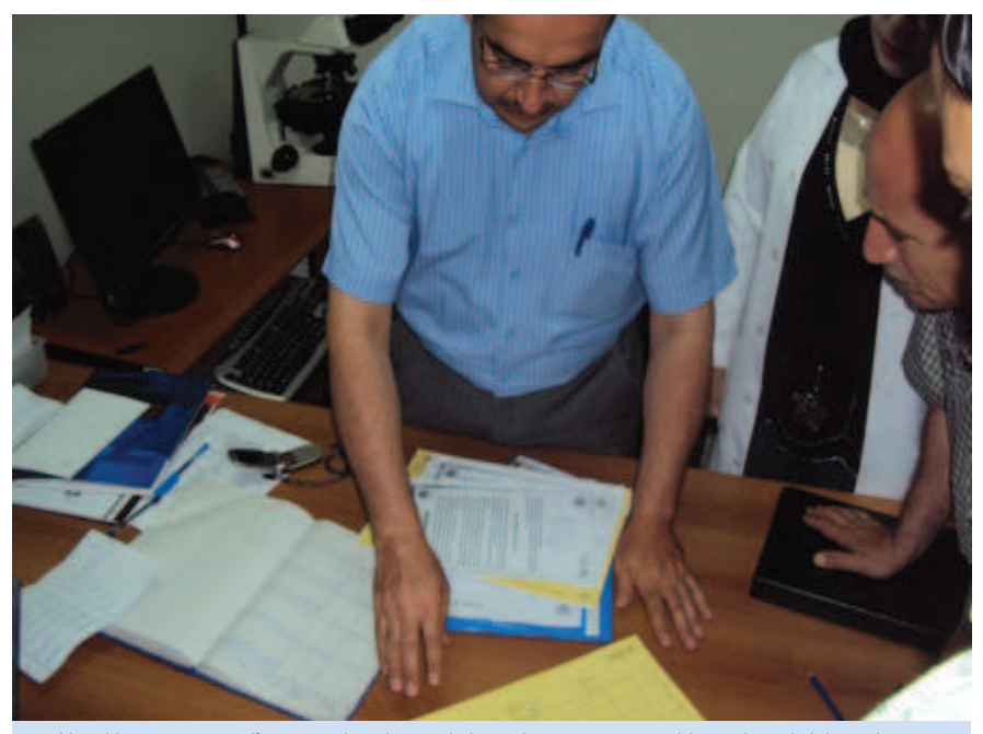
World Health Organization staff examine tuberculosis cards during their June visit to Azadi hospital in Duhuk, located in Iraq's Kurdistan region.

Stimating the burden of tuberculosis (TB) in Iraq was the focus of a World Health Organization (WHO) - Iraq workshop held in Erbil, in Iraq's Kurdistan region, from 29 May to 2 June 2011.