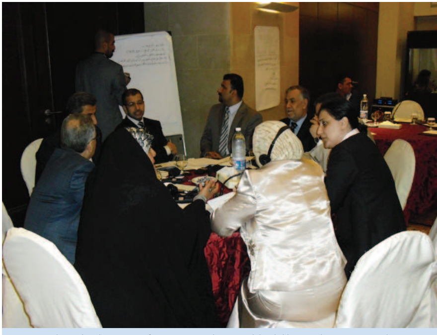
Participants discuss the selection criteria for commissioners during a workshop held on 1-6 July 2011, in Beirut, Lebanon.

A national, independent human rights body serves as a fundamental institution for advancing open, democratic governance by undertaking the promotion and protection of human rights as required by the State's international human rights obligations. The Government of Iraq is in the process of establishing such an independent institution, to be known as the Independent High Commission for Human Rights (IH-CHR).