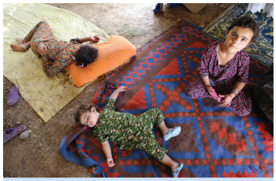
Displaced Iraqi children in Gojar, a village located along the Iraq-Iran border.