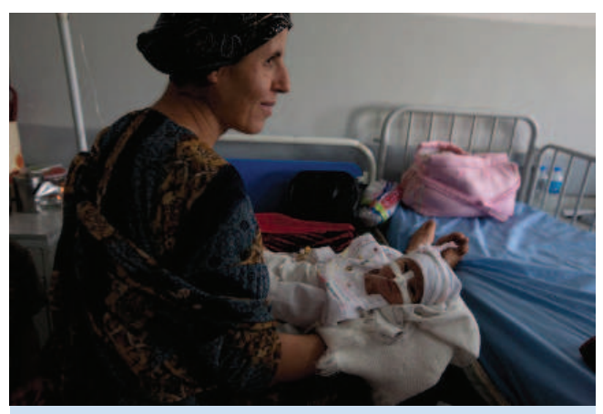
Ahmedi, Dohuk Governorate, Kurdistan region of Iraq -- A mother and her baby in Ahmedi hospital where UNICEF is implementing the Baby Friendly Hospital Initiative (BFHI) and training the staff. UNICEF's work across Iraq aims to support the Government to develop child-friendly policies, build the capacity of institutions that deliver es-sential services to children, and convene all duty bearers to realize the full rights of Iraqi children.

The UN refugee agency (UNHCR) provides cash assistance to refugee families once a year based on a needs assessment basis. In Erbil, these funds are distributed through UNHCR's Pro¬tection Assistance Center, which is managed in coordination with Public Aid Organiza¬tion, the agency's implementing partner in the region. In 2011, 133 refugee families benefited from this programme.