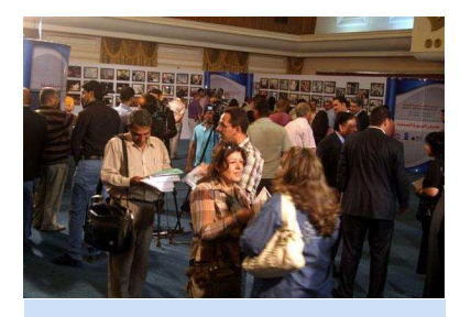
Photojournalism exhibition.