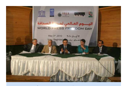
Access to Information Panel.