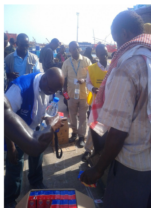
UNHCR, IOM and other humanitarian partners provide water to new arrivals at Bossaso Port, Puntland, on 6 June 2015

Onward transportation assistance: Between 4 and 8 June, UNHCR provided onward travel assistance to 337 Somali returnees (115 households) to enable them to return to their area of origin. In total, UNHCR has to date supported 1,154 individuals with onward transportation assistance. Cumulatively, the Puntland New Arrivals Task Force has assisted approximately 1,749 individuals to return to their areas of origin, primarily located in areas in South Central Somalia regions.