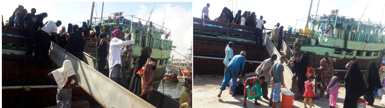
New arrivals disembark from boat Sultana, carrying 1,679 individuals fleeing Yemen, in Bossaso Port, Puntland, on 6 June 2015

A boat named Sultana , carrying 1,679 individuals (597 women, 439 men and 643 children), arrived on 6 June 2015 to the Port of Bossaso from Mukalla, Yemen. Among the new arrivals there were 63 Yemenis, 1 Ethiopian (recognized refugee in Yemen) and 1,615 Somali nationals.