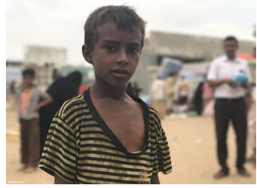
Civilians, including children continue to bear the brunt of hostilities in Yemen's war.

Further evidence of the increasing vulnerability of the Yemeni population was illustrated this week, with the release of the Humanitarian Needs Overview (HNO) for 2018. Needs across Yemen remain overwhelming, with an estimated 22.2 million people requiring some form of humanitarian or protection assistance, including 11.3 million who are in acute need, representing a worrying increase of more than one million people since June 2017. Some 8.4 million are just one step away from starvation. These figures do not include additional needs that have arisen as a result of the past month of blockade or the recent escalation of hostilities.