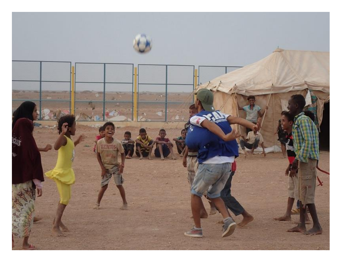
Children in Markazi camp play ball games as part of the child-friendly activities organized by ICAN. ©ICAN/July 2016.

The web portal for the Yemen Crisis is available on http://data.unhcr.org/yemen. This portal, co-lead by IOM and UNHCR, provides a regional overview as well as specific information on conditions and activities regarding the Yemen situation at the country level. Countries include Ethiopia, Djibouti, the Kingdom of Saudi Arabia, Somalia and Sudan. The site enables sharing of data on population and movements, maps, recent assessments, agency/NGO specific reports, the latest funding information and quick links to a variety of partner websites.