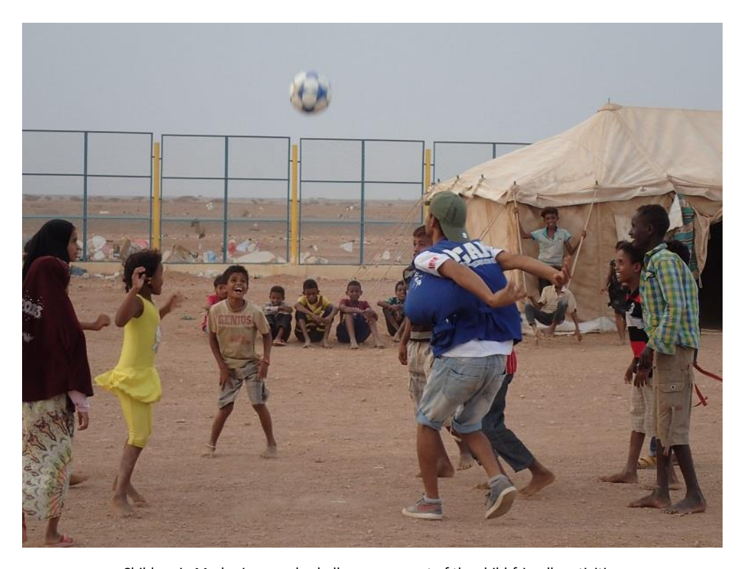
Children in Markazi camp play ball games as part of the child-friendly activities organized by ICAN.

The web portal for the Yemen Crisis is available on <a href="http://data.unhcr.org/yemen">http://data.unhcr.org/yemen</a>. This portal, co-lead by IOM and UNHCR, provides a regional overview as well as specific information on conditions and activities regarding the Yemen situation at the country level. Countries include Ethiopia, Djibouti, the Kingdom of Saudi Arabia, Somalia and Sudan. The site enables sharing of data on population and movements, maps, recent assessments, agency/NGO specific reports, the latest funding information and quick links to a variety of partner websites.