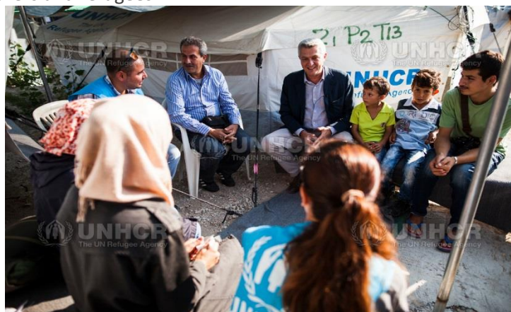
The Ogli family talk to UN High Commissioner for Refugees, Filippo Grandi, outside the tent they share at the Lagkadikia site in northern Greece. The family are waiting to be relocated to another country.